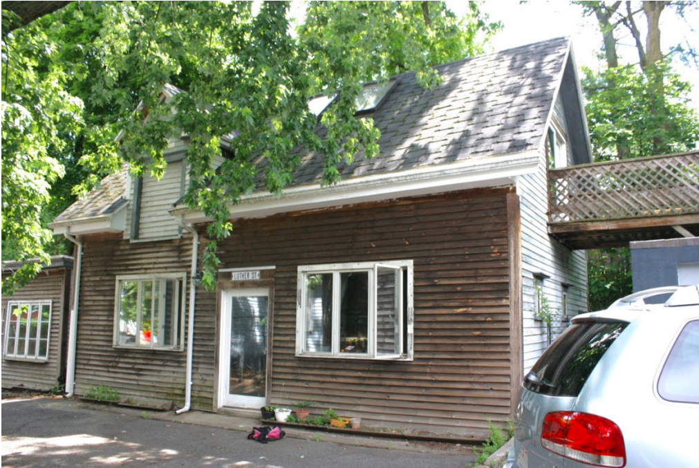
Figure 13. Carriage house, façade (northwest) and side (southwest) elevations.