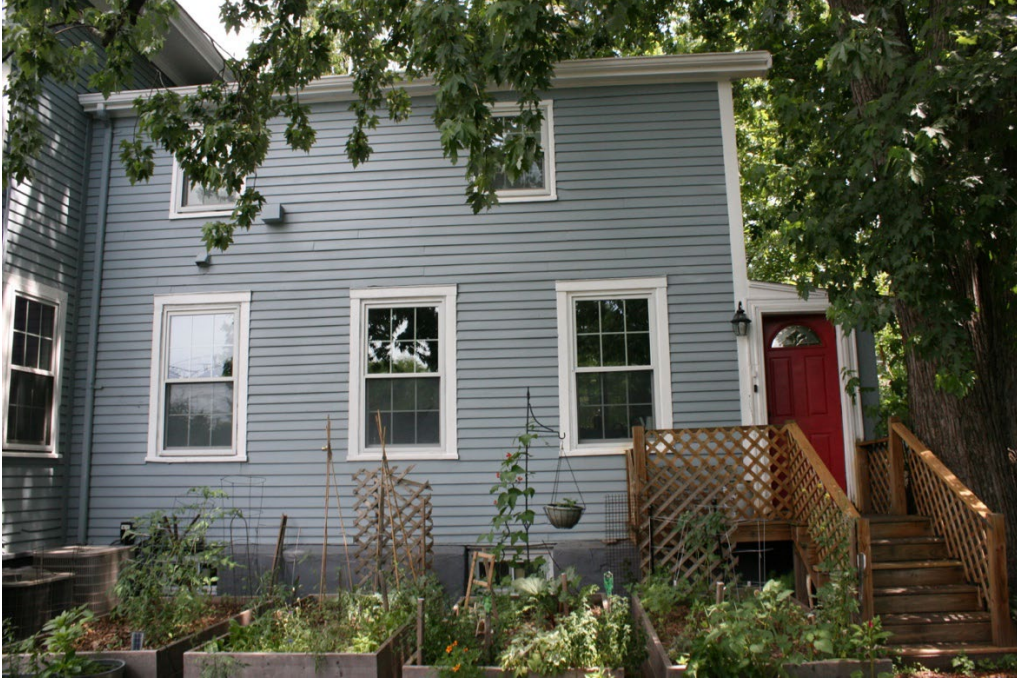
Figure 6. Ell, rear (southwest) elevation.