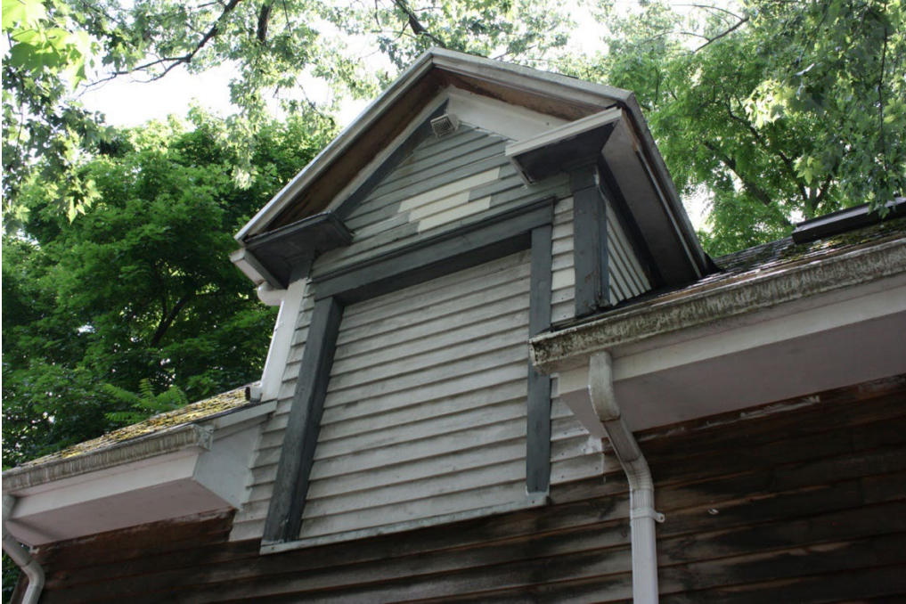
Figure 14. Carriage house facade, dormer window detail.