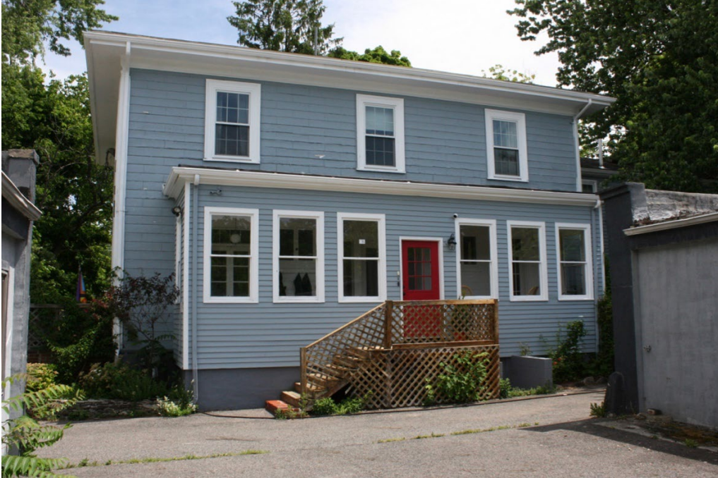
Figure 4. Main house, rear (southwest) elevation.