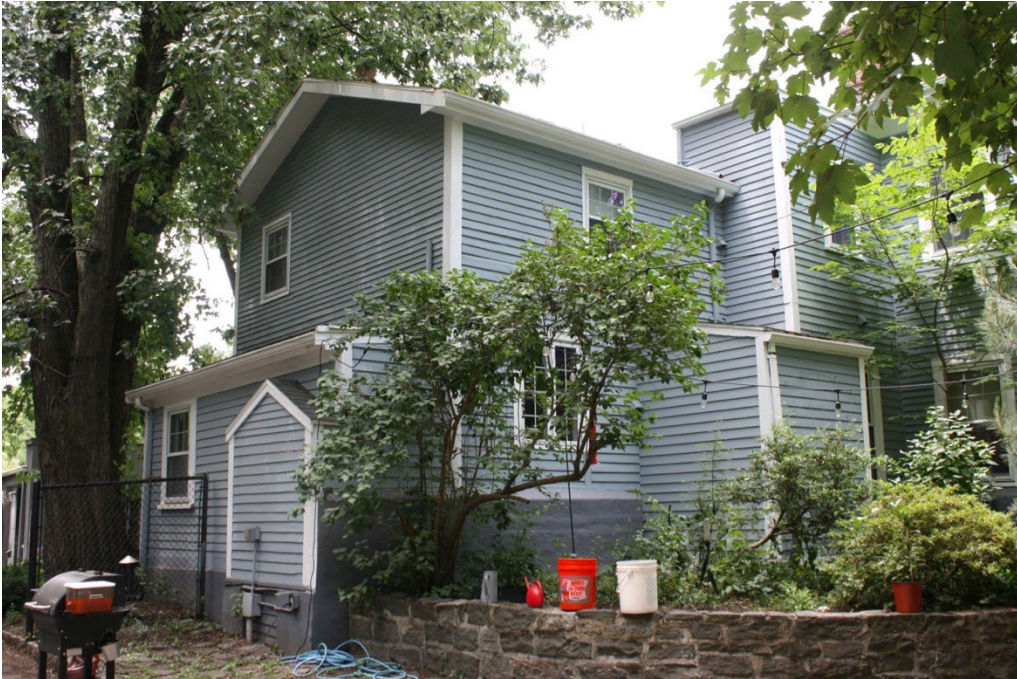
Figure 7. Ell, side (southeast) and front (Logan Street) elevations.