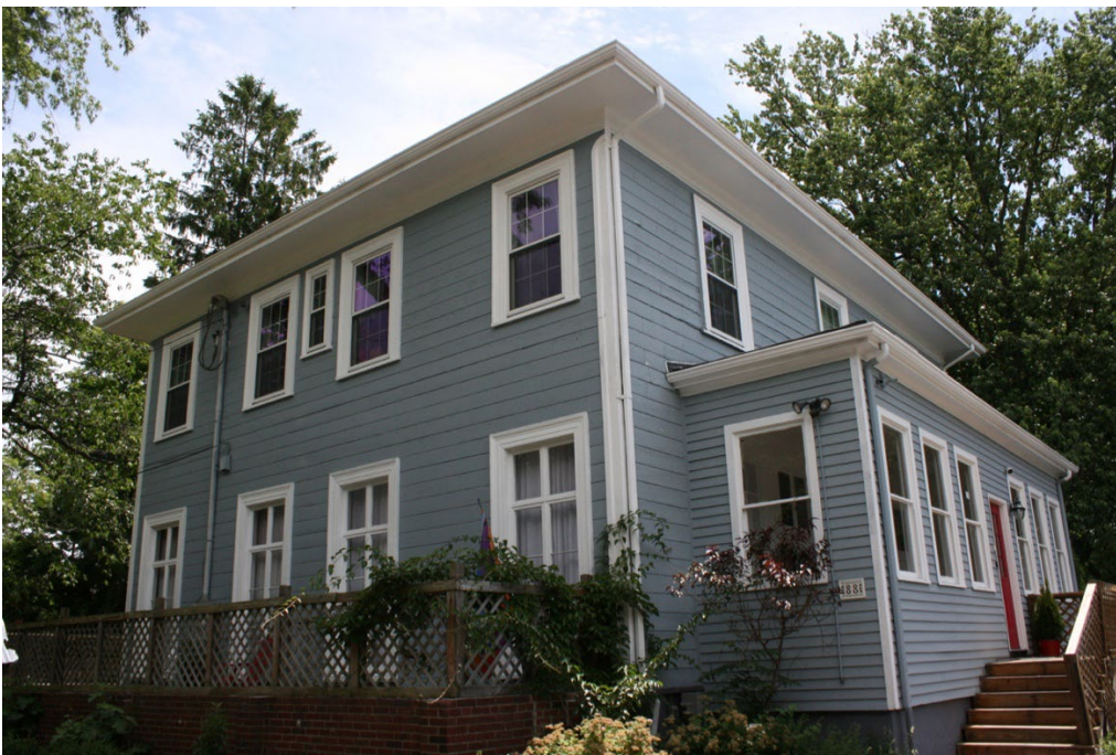
Figure 3. Main house, Lambert Ave. (northwest) and rear (southwest) elevations.