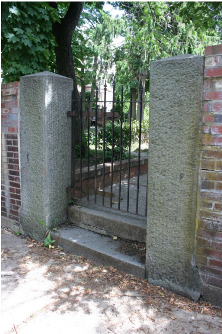
Figure 9. Lambert Ave. gate.