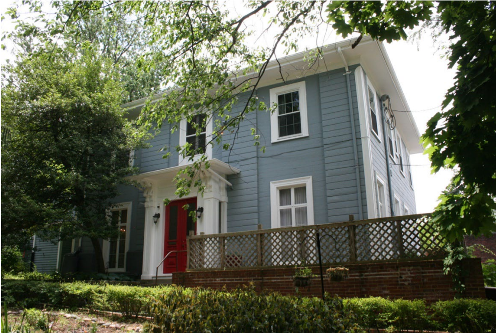
Figure 2. Main house, front (northeast) façade and Lambert Ave. (northwest) elevation.