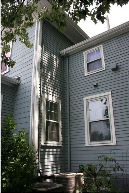
Figure 5. Main house, southeast side elevation.