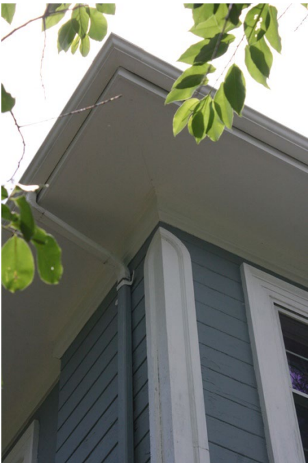
Figure 11. Main house, eave detail.