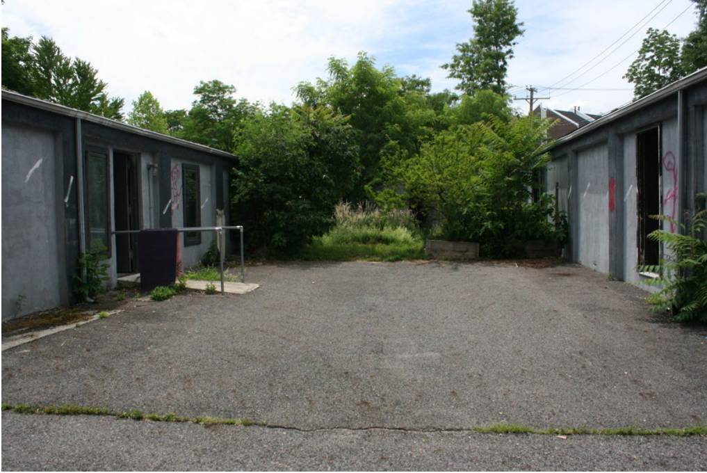
Figure 16. Middle (L) and west (R) garage buildings (demolished 2021).