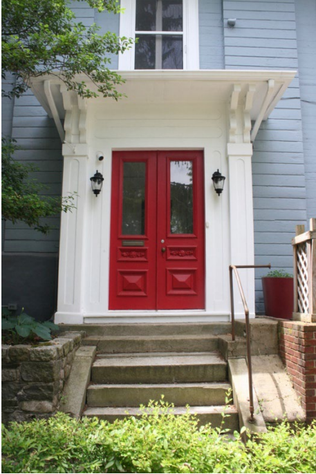
Figure 10. Main house, front entrance detail.