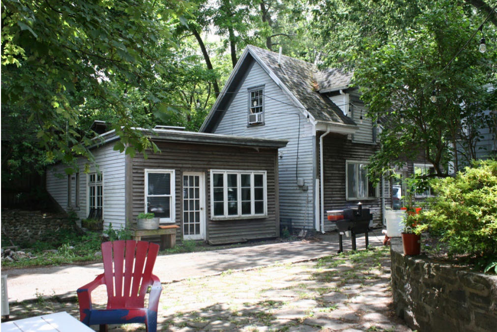
Figure 12. Shed (left; shed later demolished), and carriage house (right).