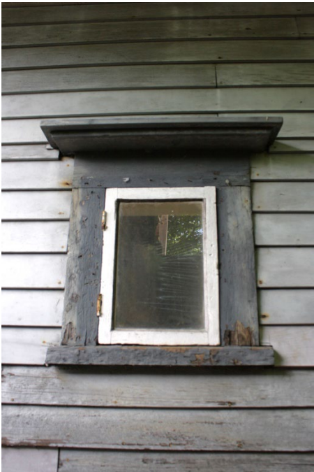
Figure 15. Carriage house, window detail on southwest elevation.