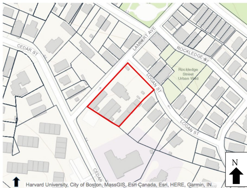
Figure 1. Map showing the boundaries of parcel # 0903679000.