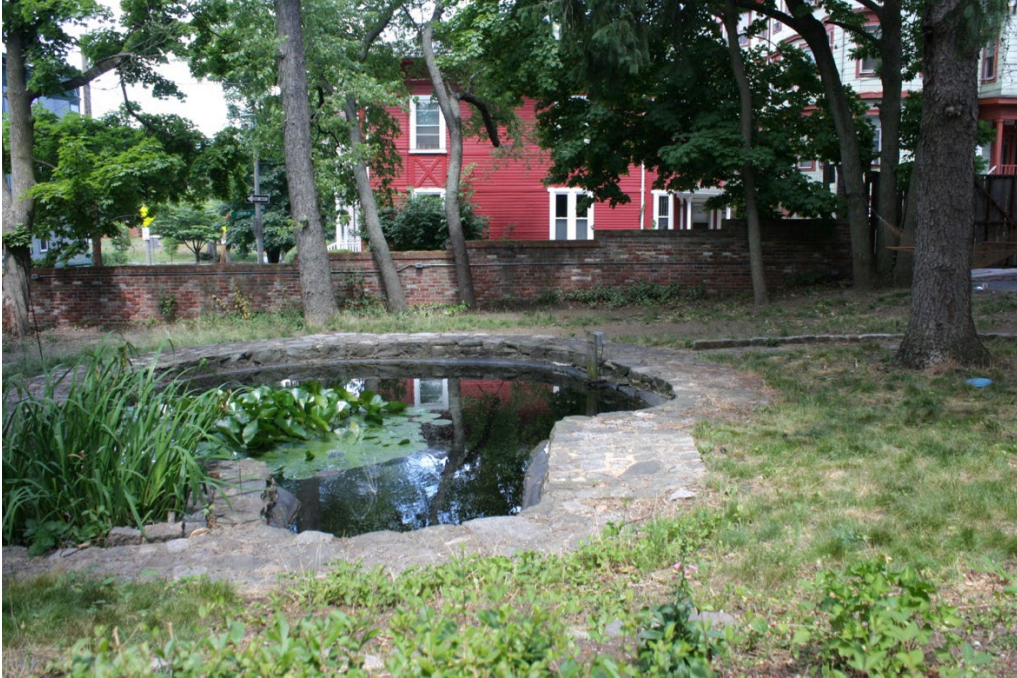
Figure 8. Front yard with ornamental pool and brick wall.