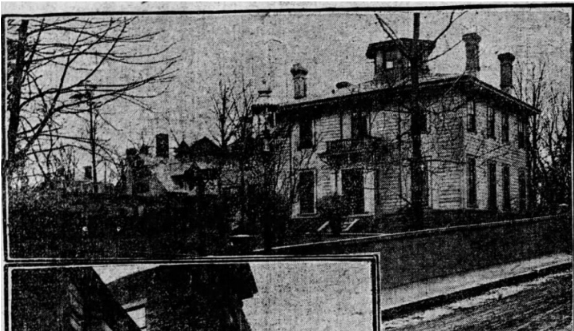
Historic Image 4. 1914 photograph. "Will Reveals Unknown Wealth," Boston Daily Globe , Feb 01, 1914.