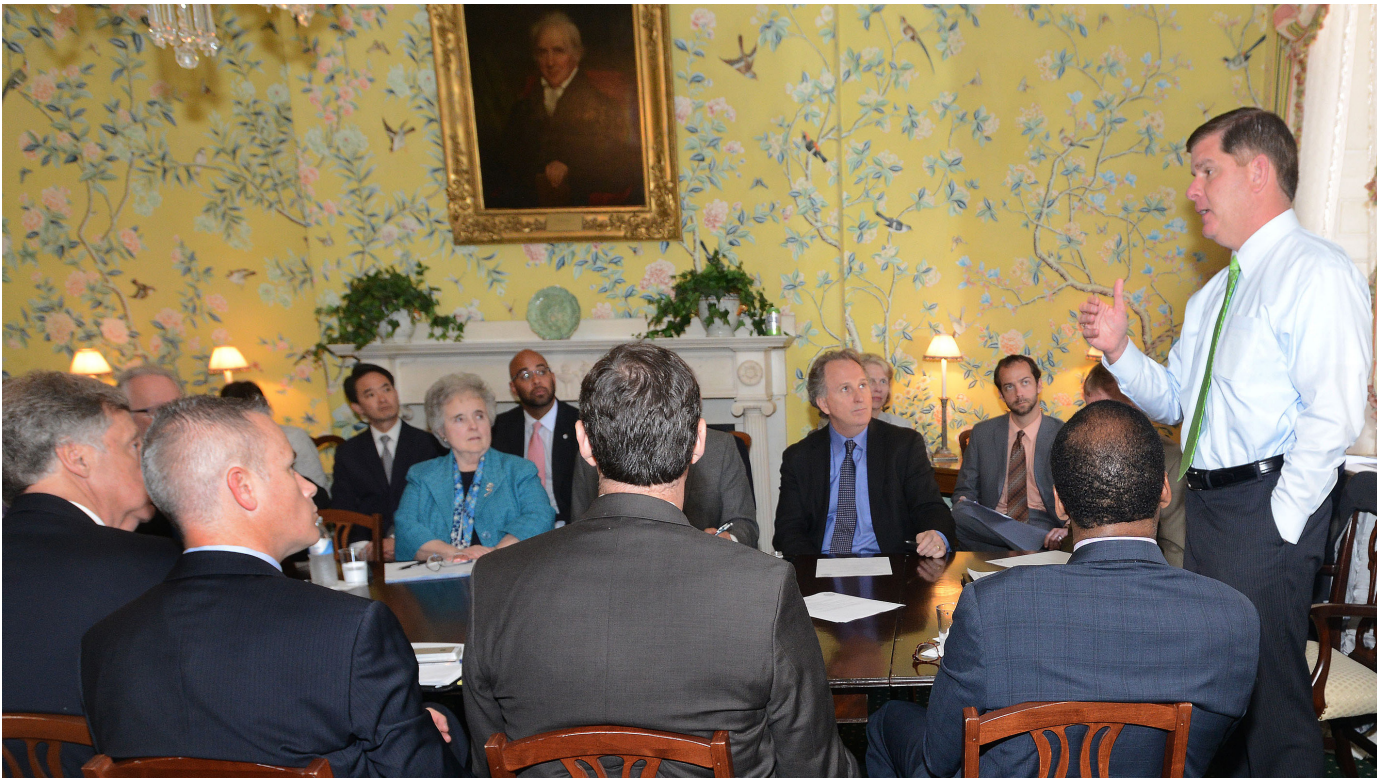
Mayor Walsh and other City officials meet with representatives from Boston's colleges and universities at the Parkman House.

Between 1995 and 2010, undergraduate enrollment grew by 13 percent. The City wants to ensure that by 2030, on-campus housing for undergraduates not only keeps up with future growth, but also substantially reduces the number of undergraduates living in off-campus housing in Boston. Additionally, although graduate student enrollment grew by 47 percent from 1995-2010, very few graduate students are housed on campus. The City will encourage colleges and universities to create enough housing for graduate students to mitigate their impact on the market.