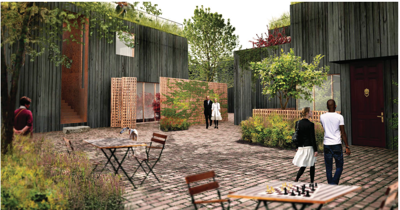
Public Courtyard for Parker & Terrace E+ Development, Mission Hill

Boston is currently preparing an updated Climate Action Plan, a formal work plan that will help ensure that Boston achieves its carbon reduction goals and is prepared for the impacts of climate change. Specific goals and actions, e.g., percentage reductions for different categories, will be provided in that work plan.