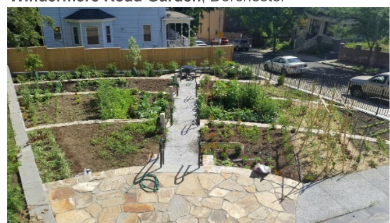
Windermere Road Garden, Dorchester