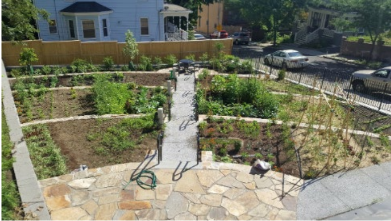
Windermere Road Garden, Dorchester