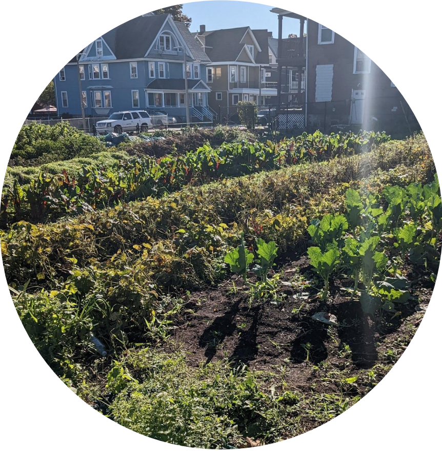
The Food Project - East Cottage Farm

GrowBoston's goal is to increase food production and support local food producers in Boston, including gardeners, farmers, beekeepers, and more.