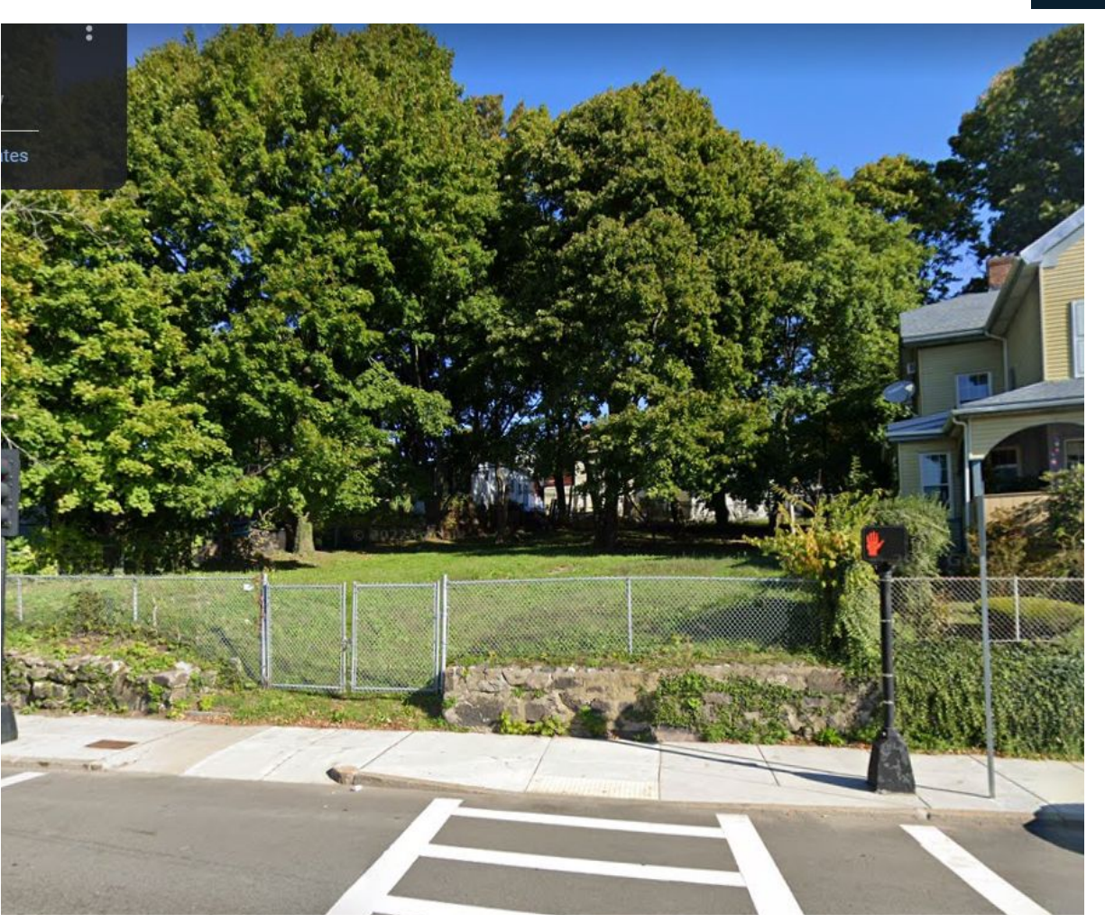
Views from Washington Street