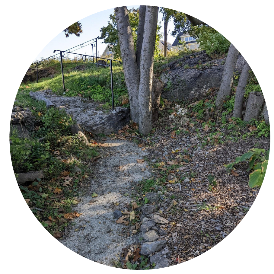
Savin Hill Wildlife Garden, Dorchester