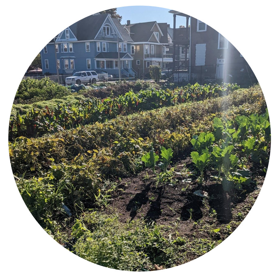
East Cottage Farm, Roxbury