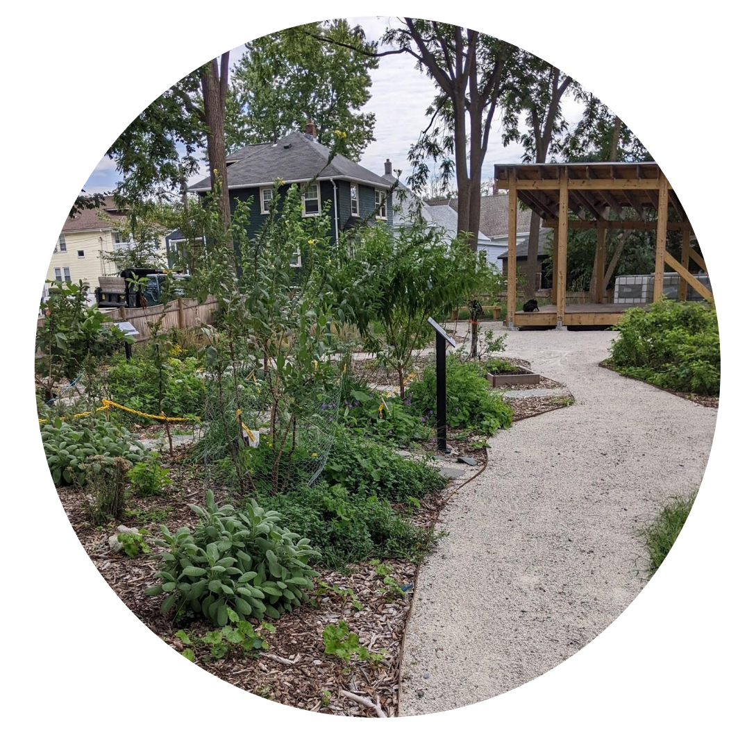
Edgewater Food Forest, Mattapan