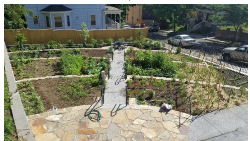
Eastie Farm, East Boston