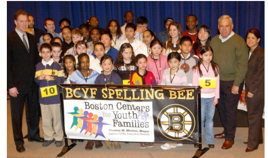
2008 Inaugural year of the BCYF Spelling Bee!

In 2008, BCYF started a new tradition for Boston by hosting the first citywide BCYF Spelling Bee. Over the next eight years, BCYF, in partnership with the Boston Bruins Foundation, has continued the tradition of the BCYF Spelling Bee. Each year, family members, friends, and teachers proudly cheer on the spellers at the citywide Bee.