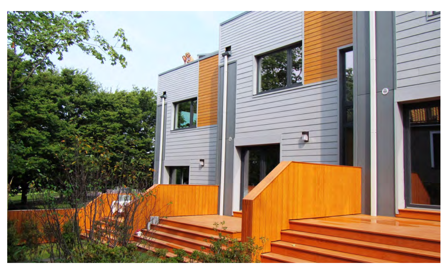
Boston's first Energy+ housing development in Roxbury produces about twice as much energy as it consumes,

While greening new construction is important, Boston must also make significant improvements to its existing building stock, both in terms of energy efficiency and climate preparedness. Since only one percent of the city's building stock is replaced each year, an extensive retrofitting plan is essential. The City of Boston, in partnership with the Commonwealth and the utility companies, has excellent residential energy efficiency programs. In 2013, Boston was named the most energy efficient city in the nation based on its policies and programs, and Massachusetts was named the most energy efficient state. Through the City's Renew Boston program, residents living in buildings with four or fewer units can receive a free energy assessment that