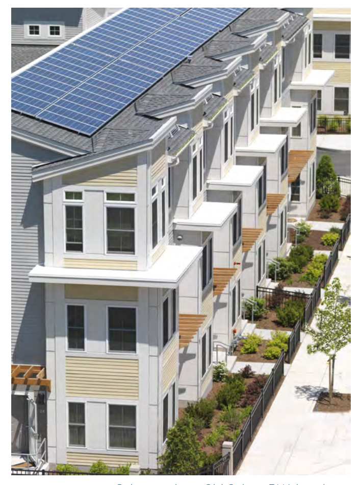
Solar panels on Old Colony BHA housing

The City will continue to work on educating renters and homeowners alike about projected climate impacts, and what they can do to prepare their homes. Simultaneously, the City will explore policy options, planning initiatives, and incentives to ensure that new and existing housing is prepared for the effects of climate change.