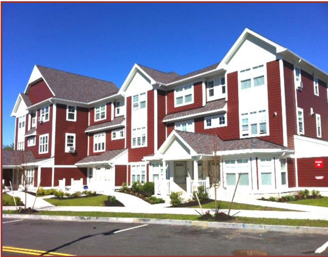
Olmstead Green Rentals, Phase Three

FOR PROGRAM YEAR 2013 (JULY 1, 2013 TO JUNE 30, 2014)