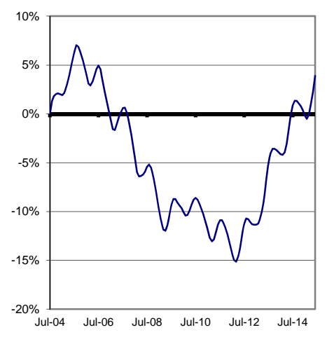
Cum. Change in Freddie Mac Home Price Index June 2004 to June 2015

Prices of existing homes are slowly increasing according to two sources of data. The National Association of Realtors reports that in the second quarter of 2015, the median sale price of an existing home in the Boston MSA was $414,600, an increase of 4.1% over the same quarter in 2014. This recent value is a 42.6% increase from the recent nadir in the first quarter of 2009, but still 1.5% below the peak in the second quarter of 2006. A look at the cumulative change in the Freddie-Mac Home Price Index (Figure 4) shows that cumulative price changes since December 2004, negative since September 2008, finally turned positive in June 2013.