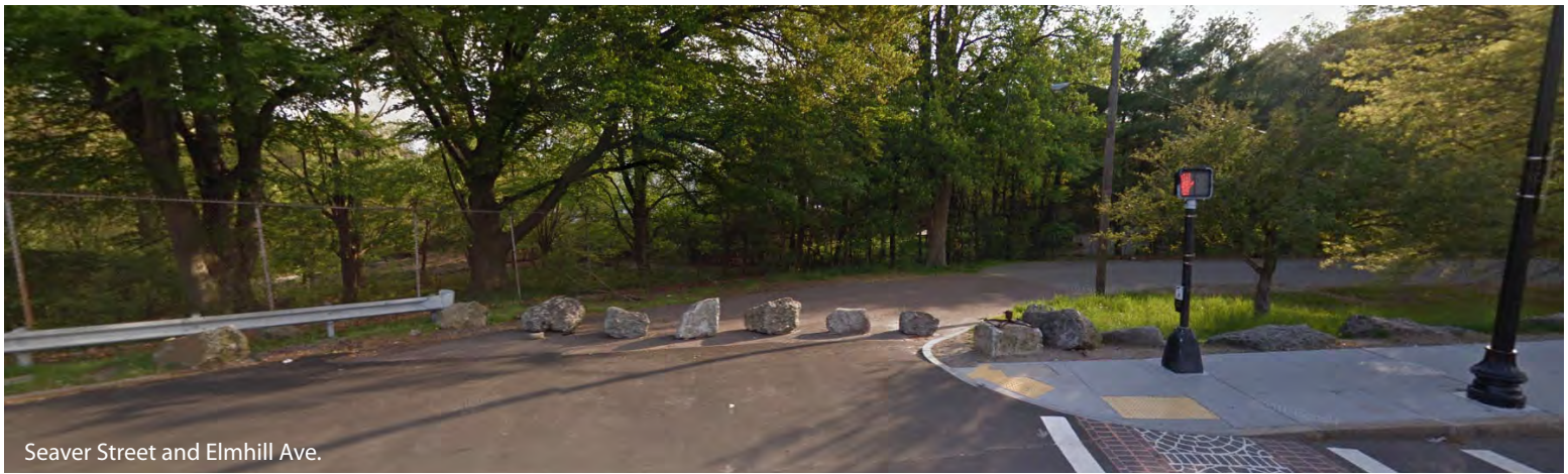
Seaver Street and Elmhill Ave.

Between Seaver Street and Playstead Road Williams Street to Ellicott Arch Seaver Street and Walnut Avenue