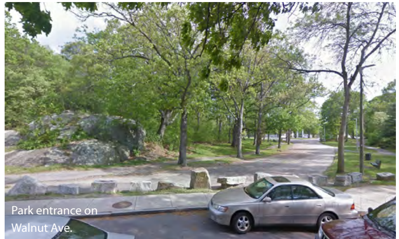
Park entrance on Walnut Ave.