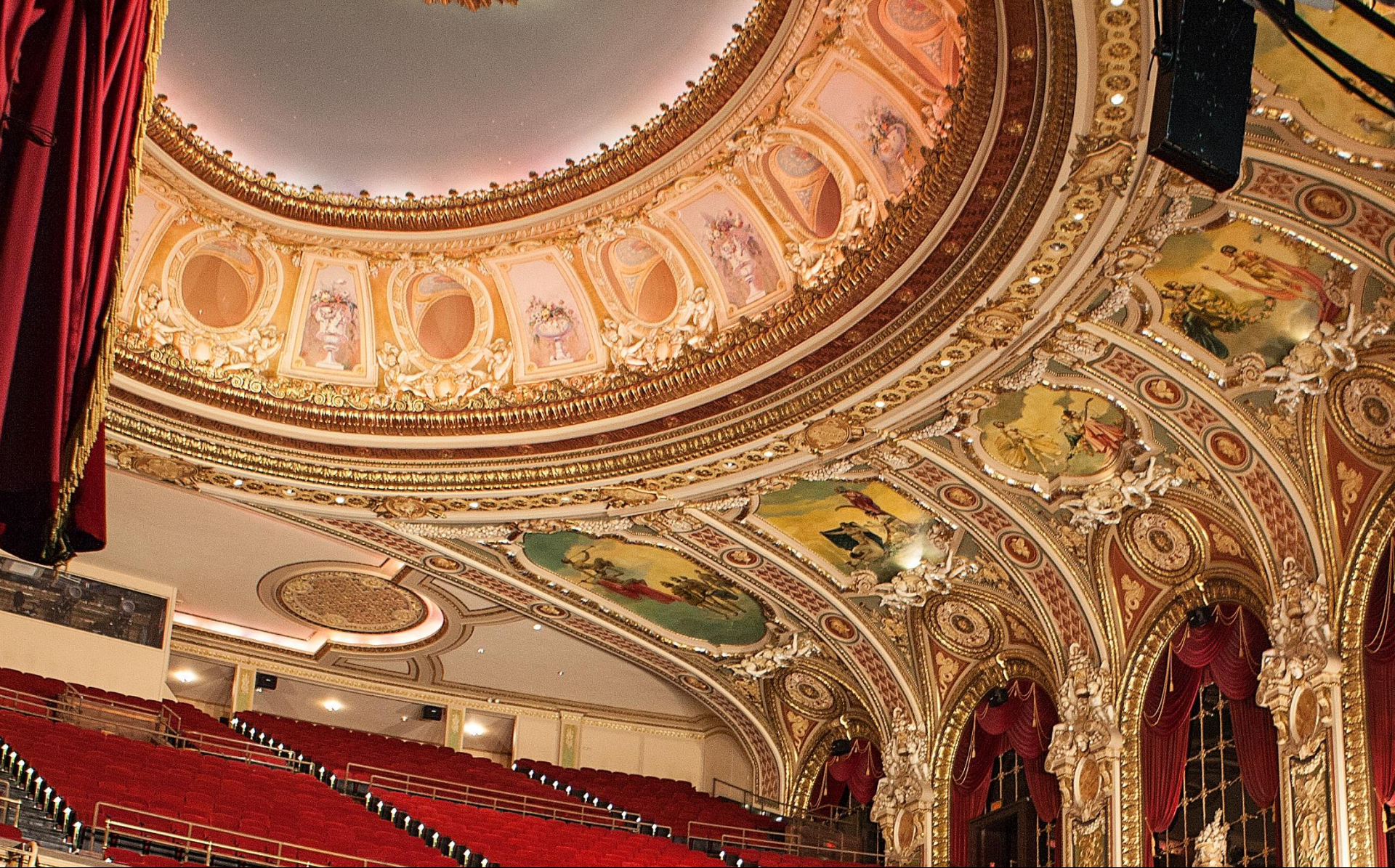
The Wang Theatre, February 2017

End standard new colors replicate the green, yellow and gold hues of the murals found on the ceiling and restored in the late 1980s/ early 1990s.