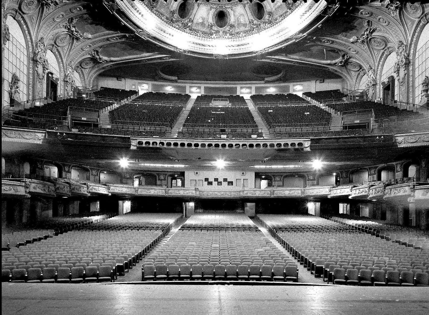
The Wang Center (then Music Hall), February, 1976