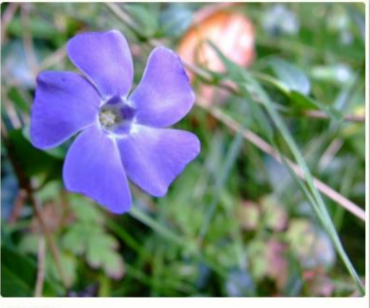
Vinca minor xlibber, CC BY - 2.0