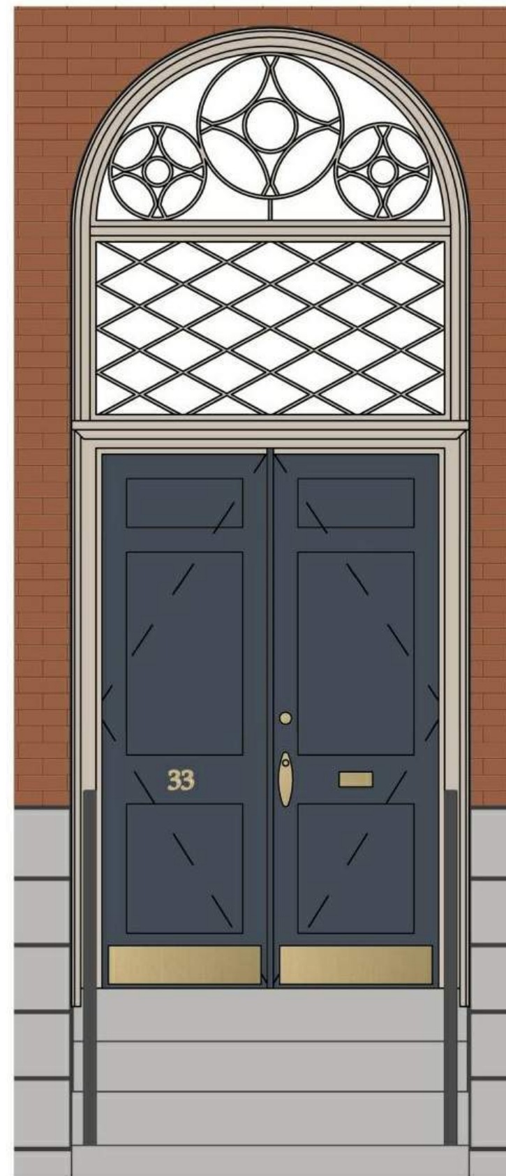
OPTION 2 - BLUE DOOR & BEIGE TRIM