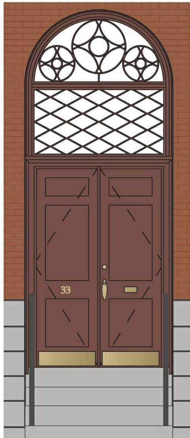
OPTION 1 - RED DOOR & TRIM