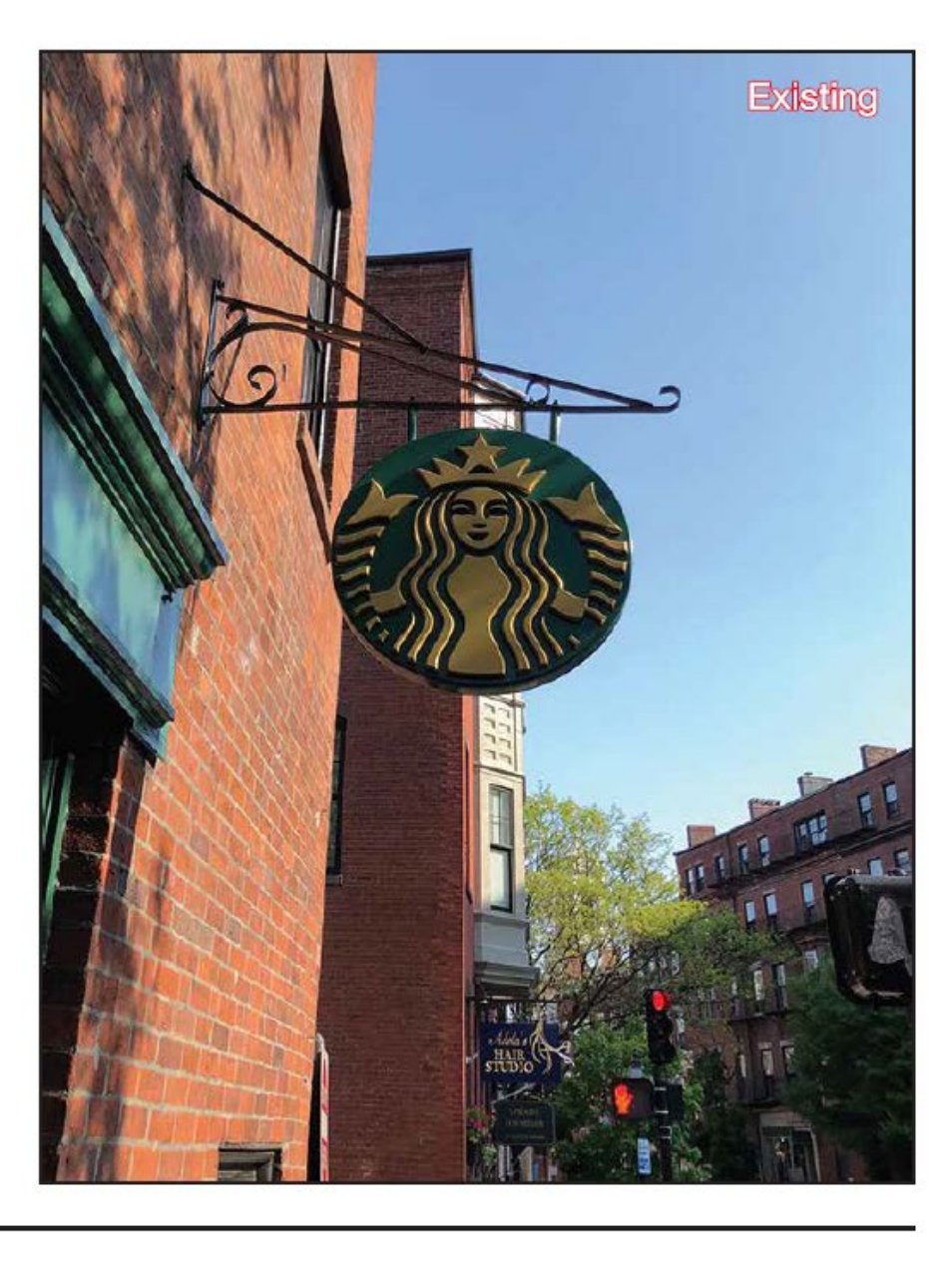
Photo Elevation Views: #10534 Proposed New Non-Illuminating Double Sided Blade Sign and Existing PE