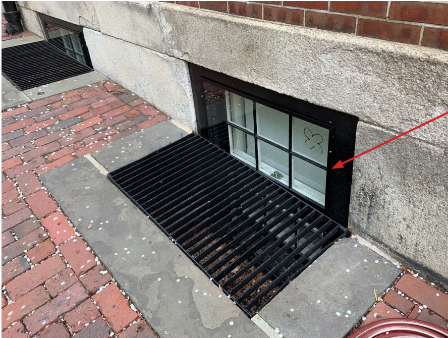
EXAMPLE SHOWING ENERGY PANEL INSTALLED OVER EXISTING WINDOW TO REMAIN