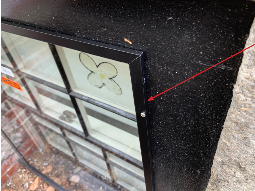
DETAIL OF PROPOSED 5/8"W X 5/16"D BLACK METAL FRAMES