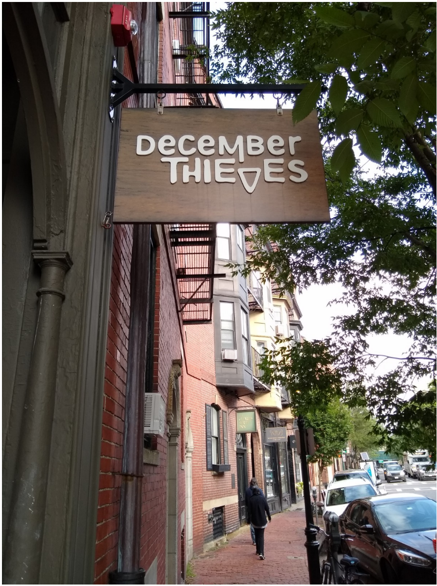
EXISTING SIGN AND BRACKET