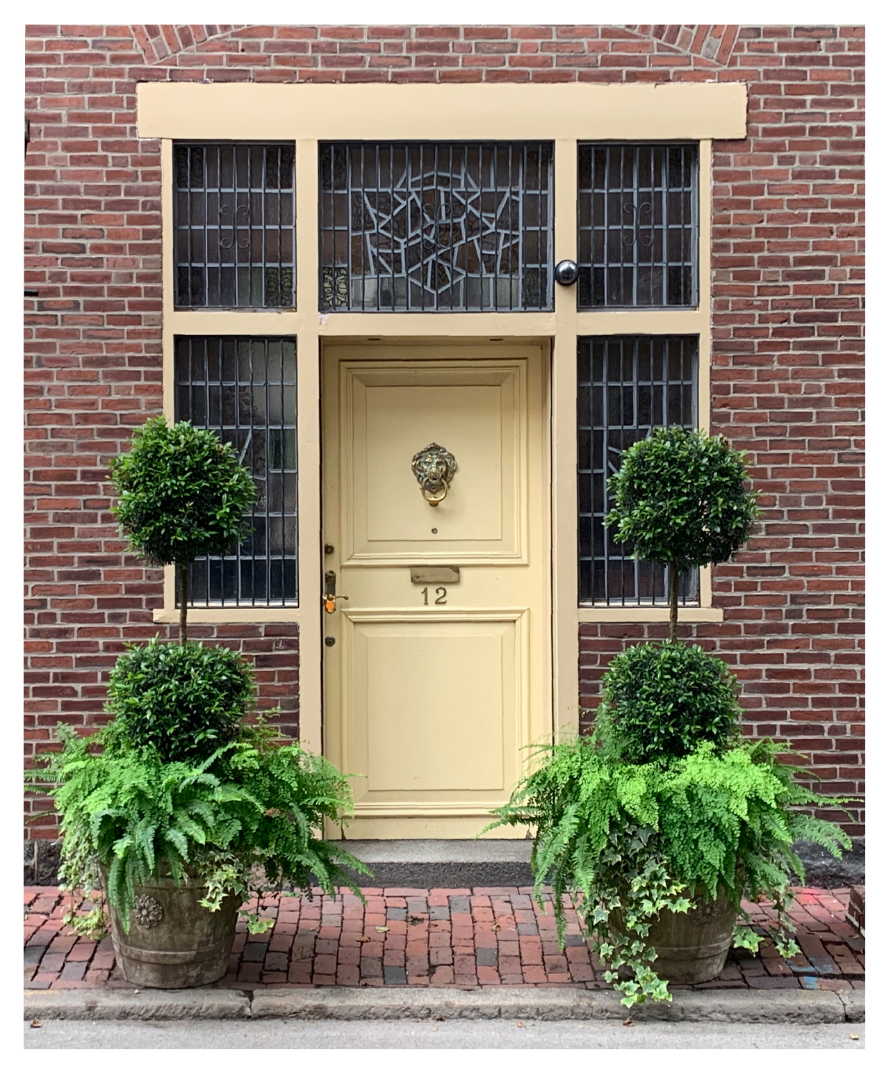
(1.) EXISTING FRONT ENTRY ELEVATION