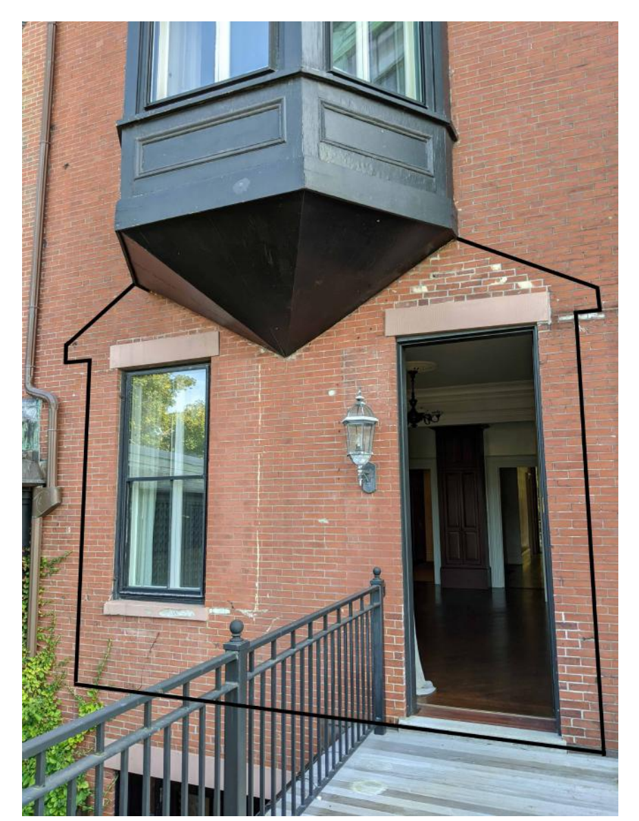
black outline denotes area of brick removal