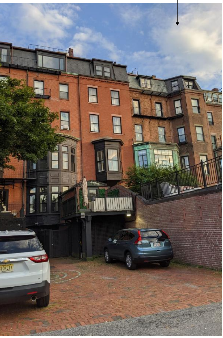
rear elevation view