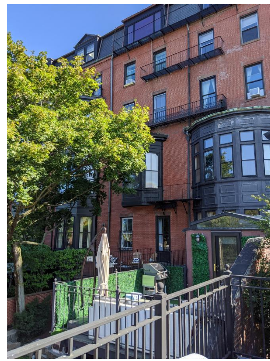
neighboring similar oriole with lower trim removed