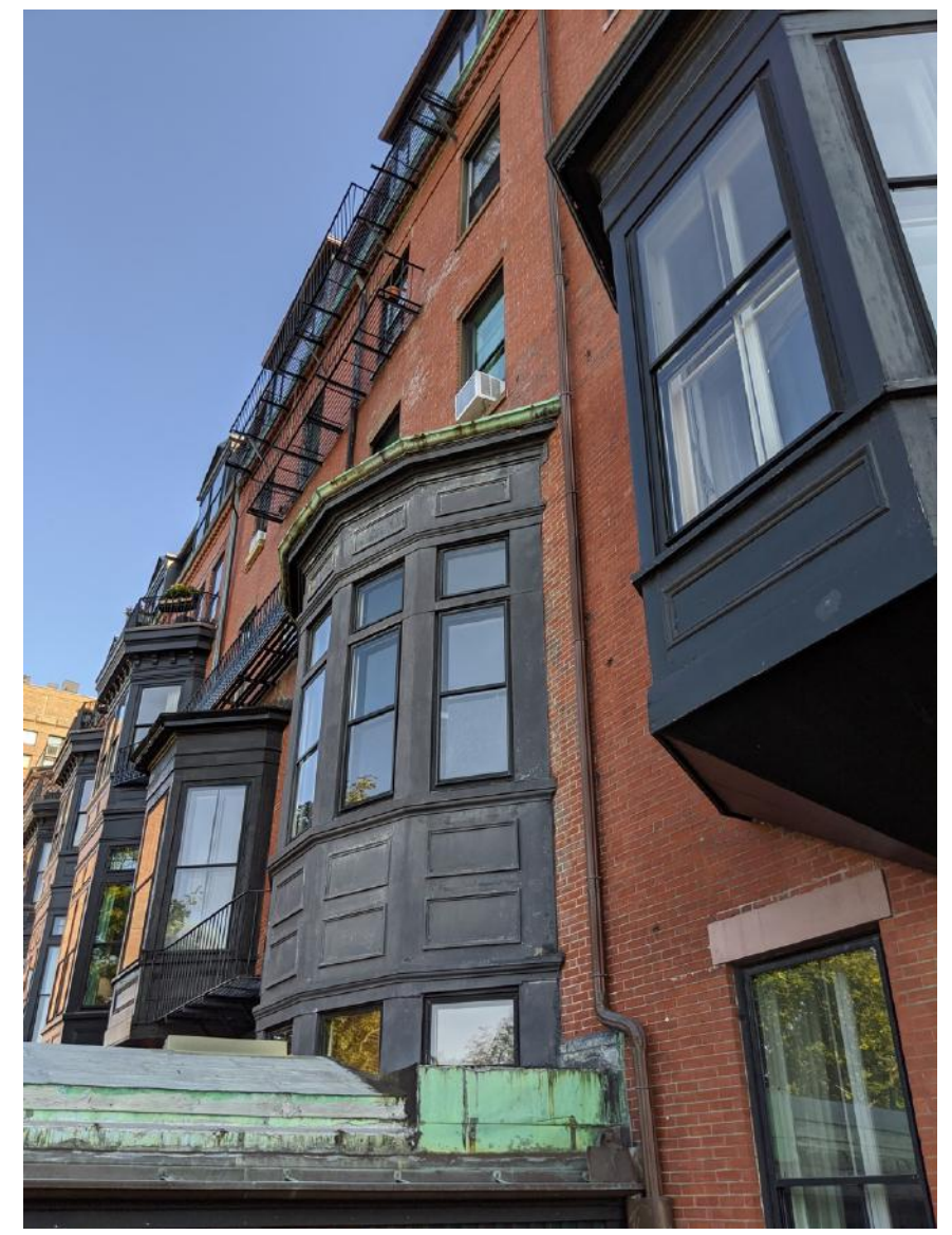
abutting 2 story oriole