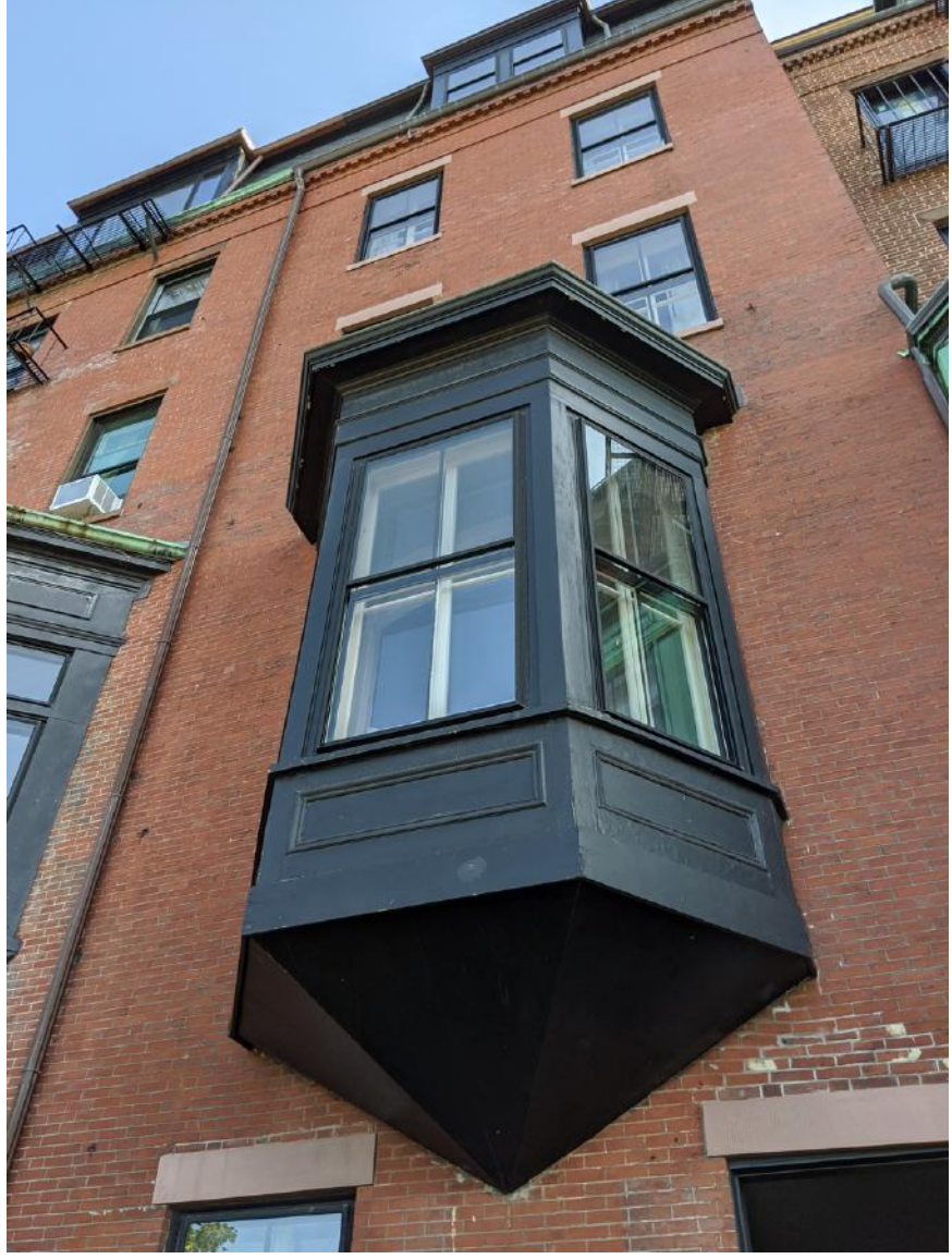
existing oriole, wood exterior painted black