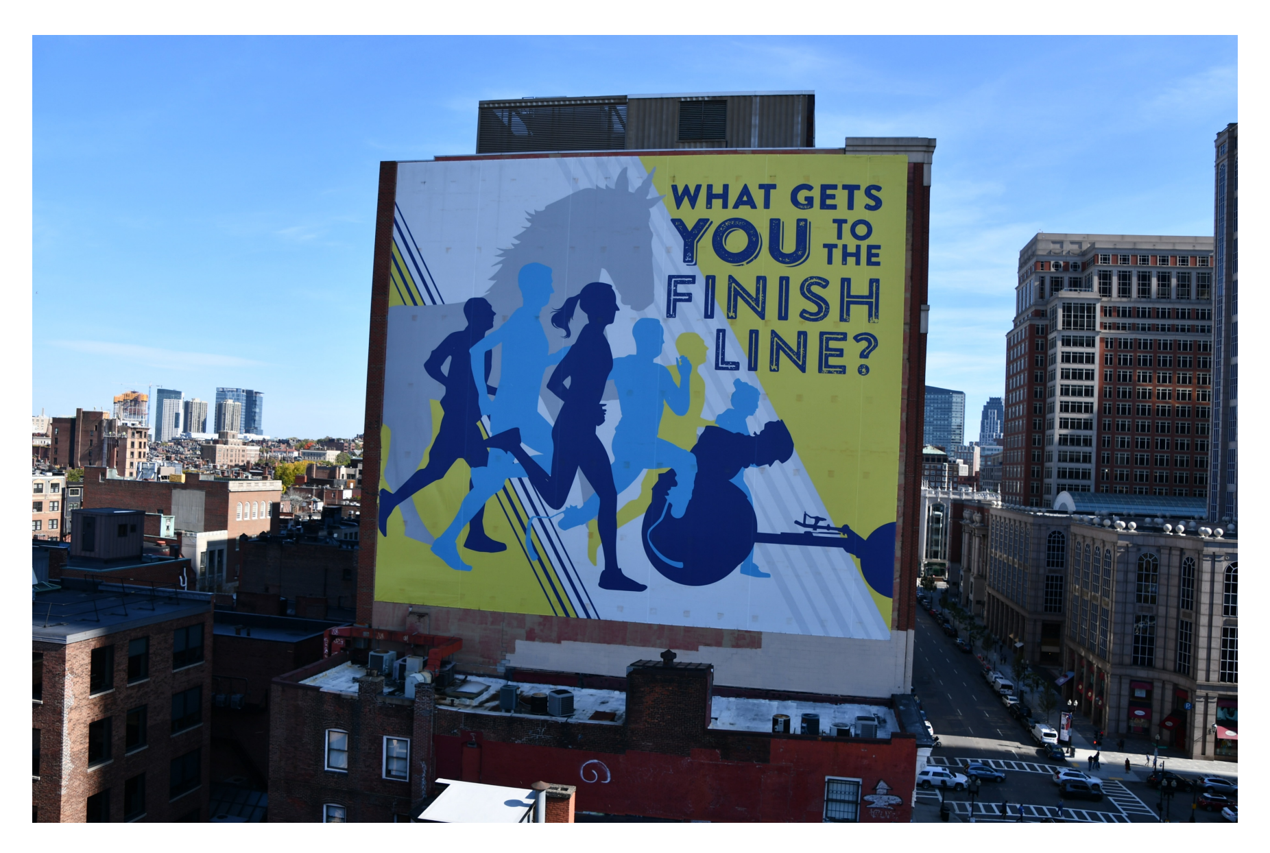
View of banner currently looking from adjacent building.