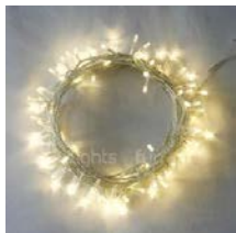
LED lights on a string