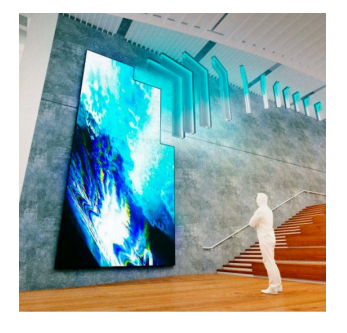
Memory/Diffusion by MASARY Studios at Boston Arts Academy