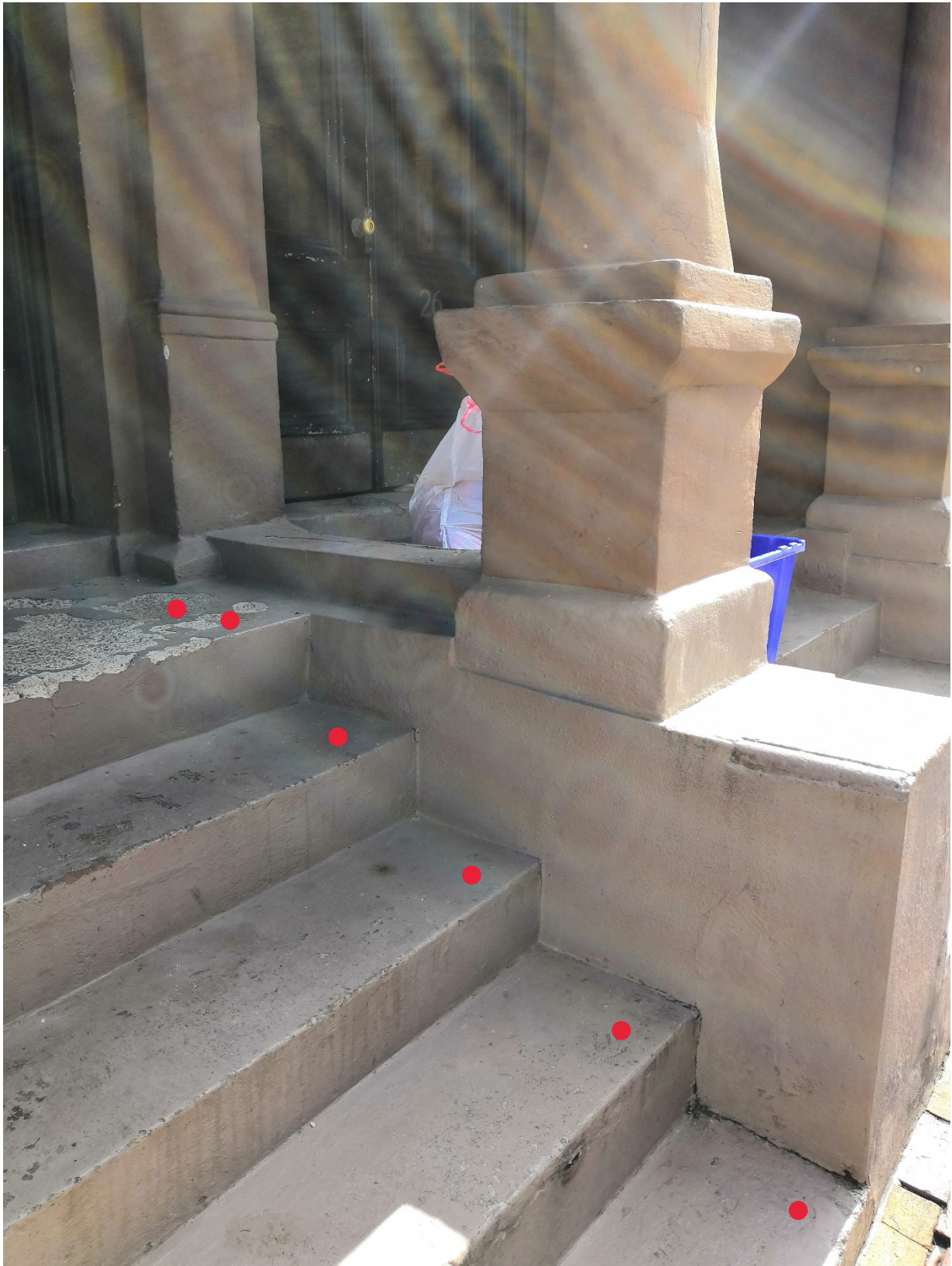
● 24 Hancock Railing Anchor