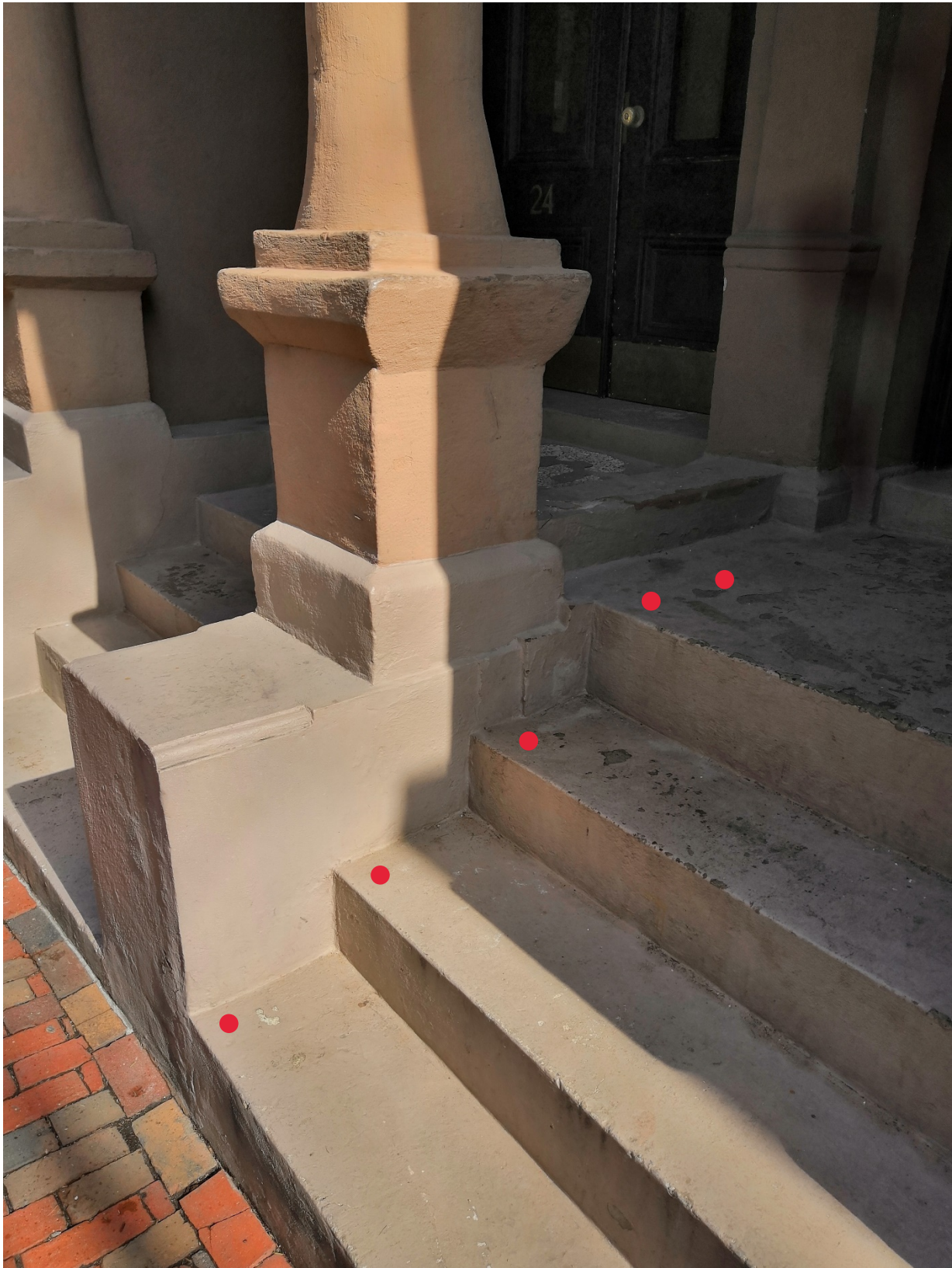
● 26 Hancock Railing Anchor