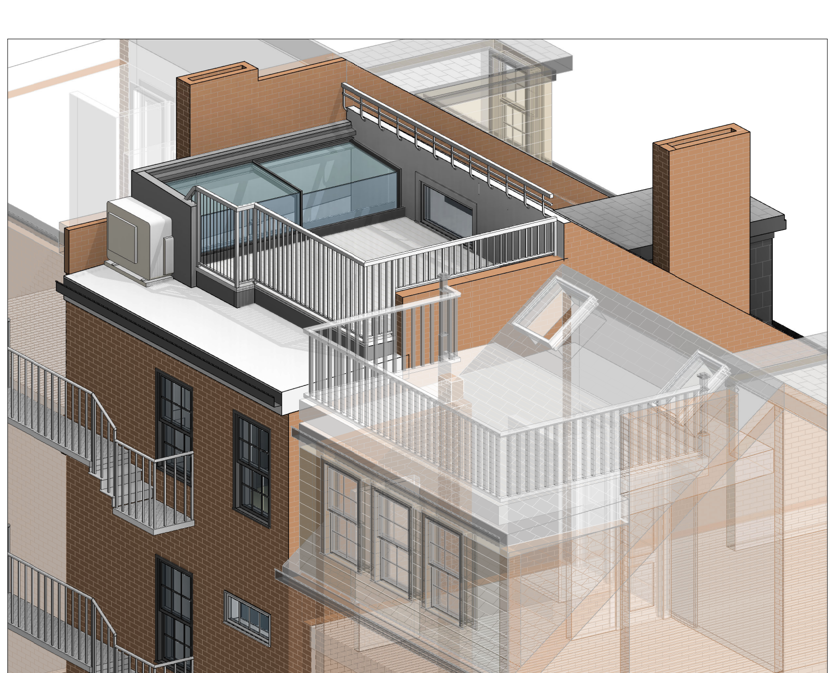
5 3D ROOF DECK BACK