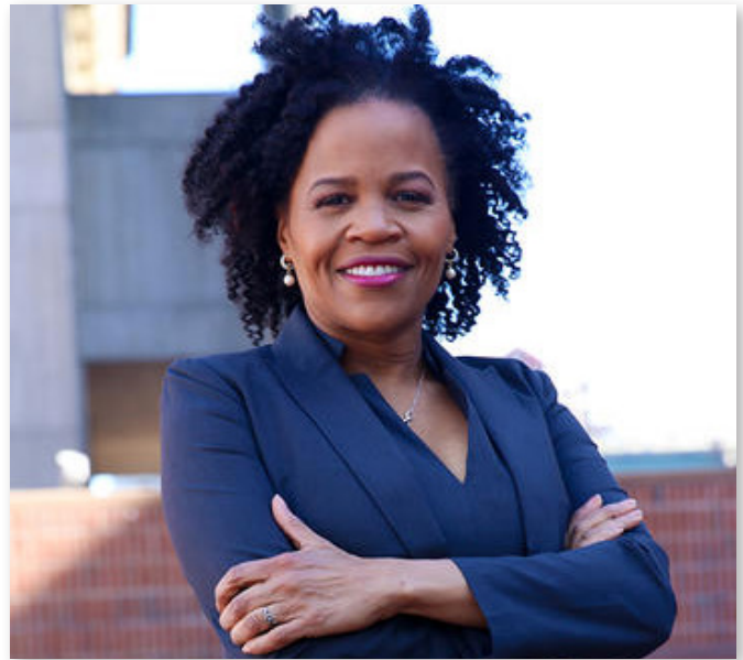
Kim Janey, Mayor of Boston

is published weekly by the City of Boston, 1 City Hall Square, Boston, MA 02201, under the direction of the Mayor, in accordance with legislative act & city ordinance. The periodical postage is paid at Boston MA.