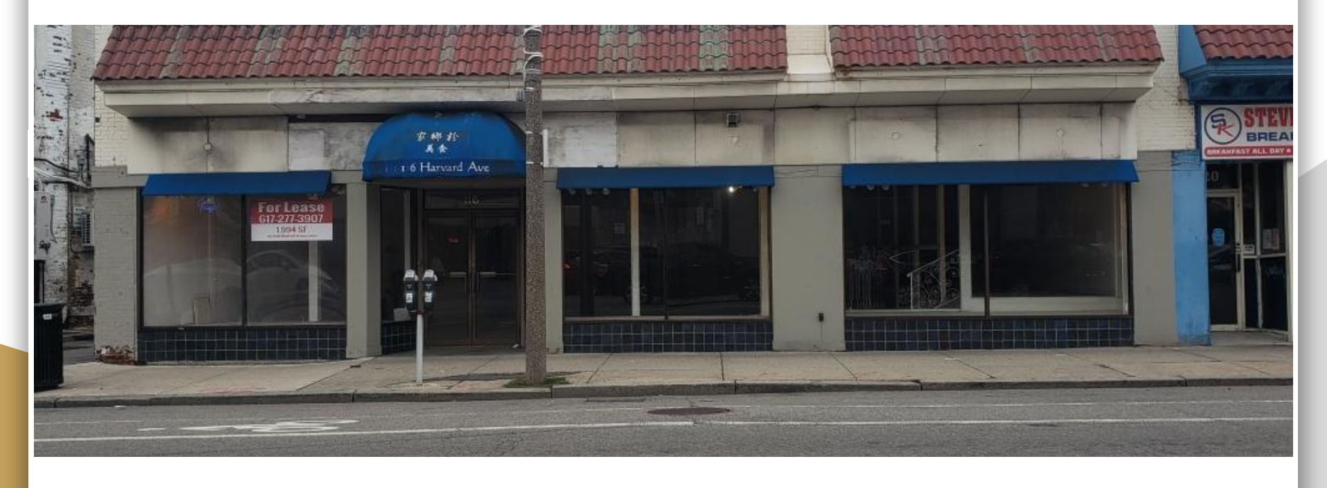
116 Harvard Ave Allston Ma 02134

We have obtained his location through a lease agreement. It is 2,000 sq ft street level retail, 2,000 sq ft basement.