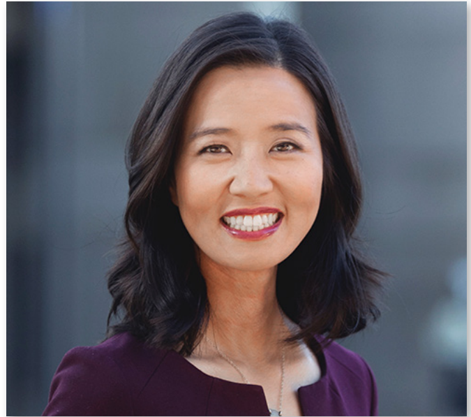
Michelle Wu, Mayor of Boston

is published weekly by the City of Boston, 1 City Hall Square, Boston, MA 02201, under the direction of the Mayor, in accordance with legislative act & city ordinance. The periodical postage is paid at Boston MA.