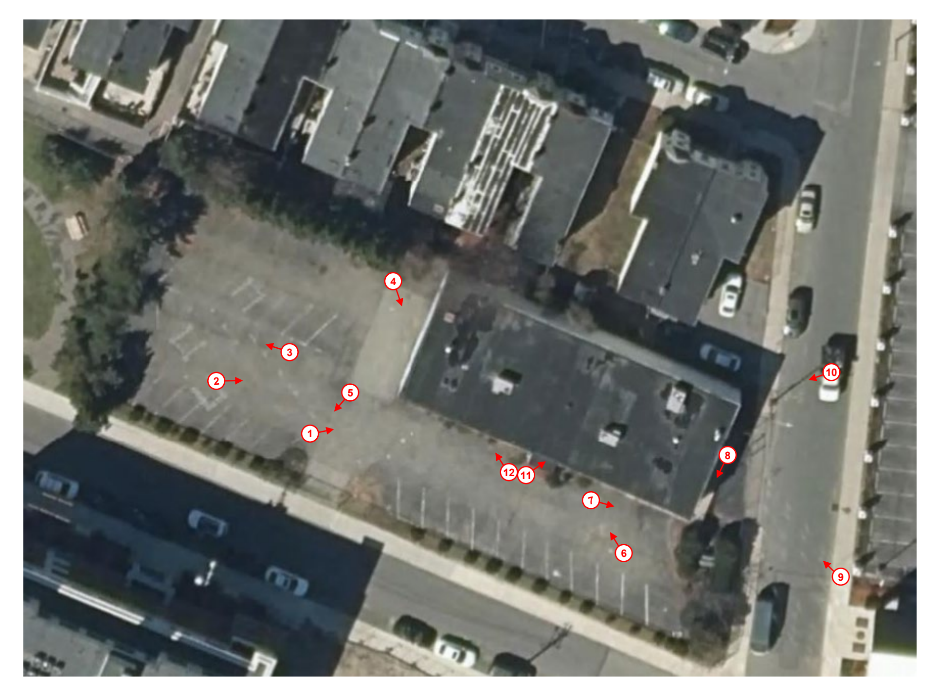
90 Braintree Street, Allston