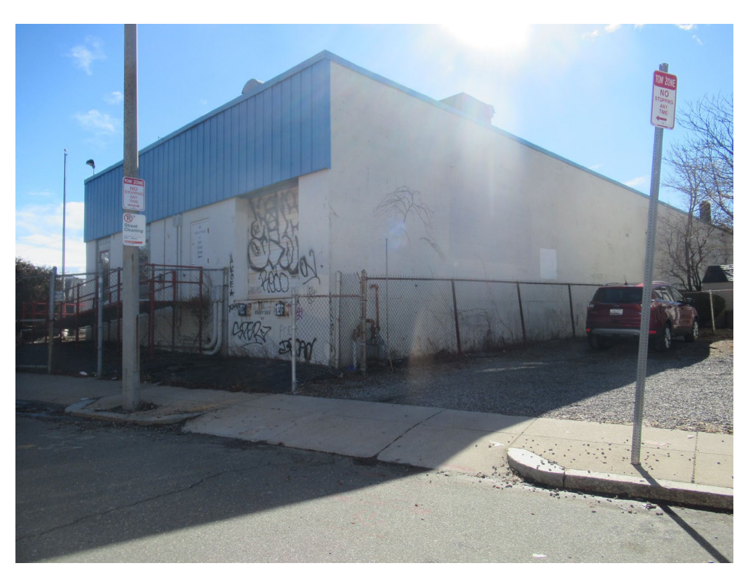
10. North and west elevations, looking southeast