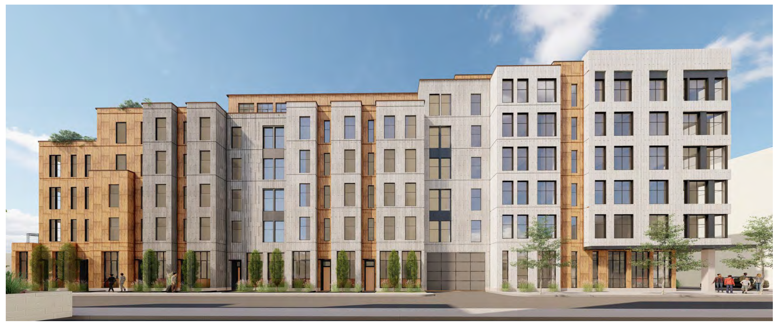
VIEW OF PENNIMAN ROAD ELEVATION