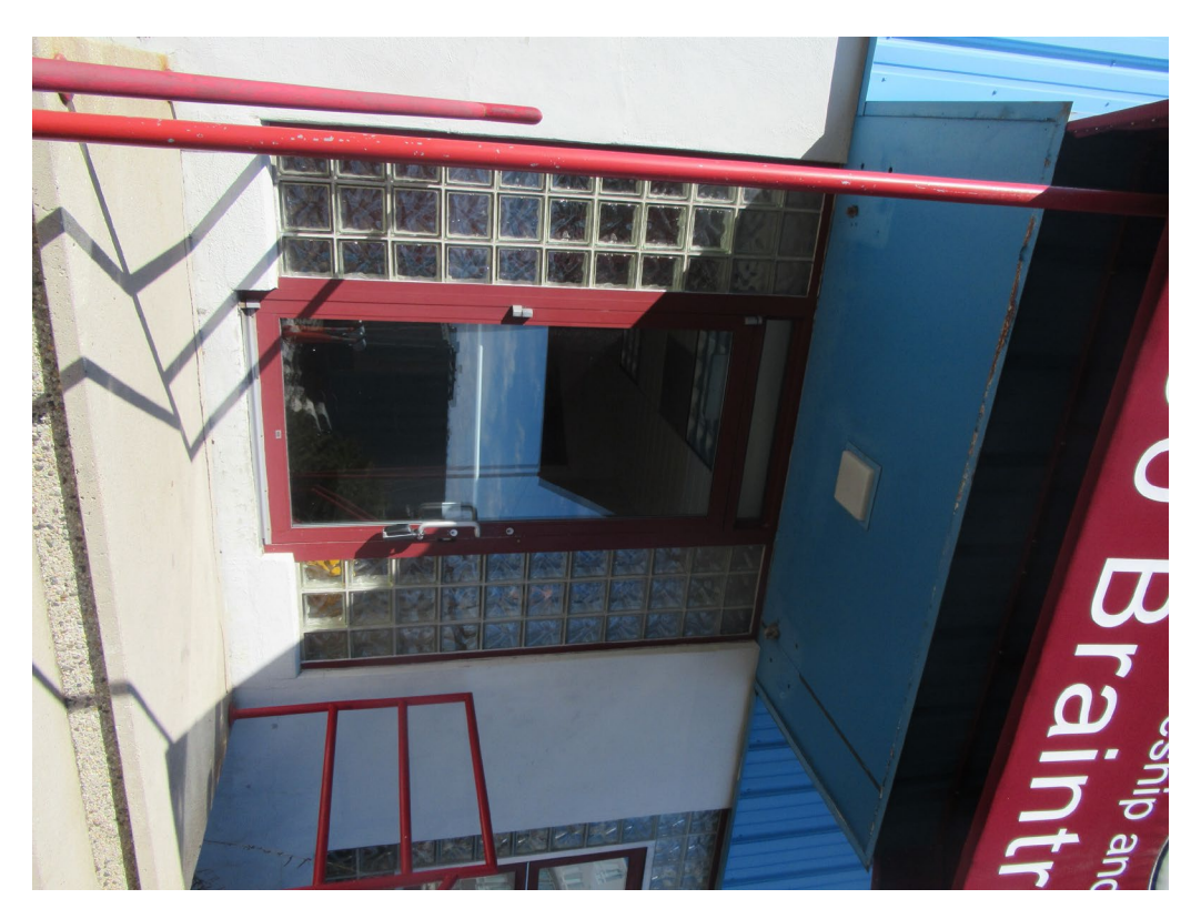
11. Main entryway detail