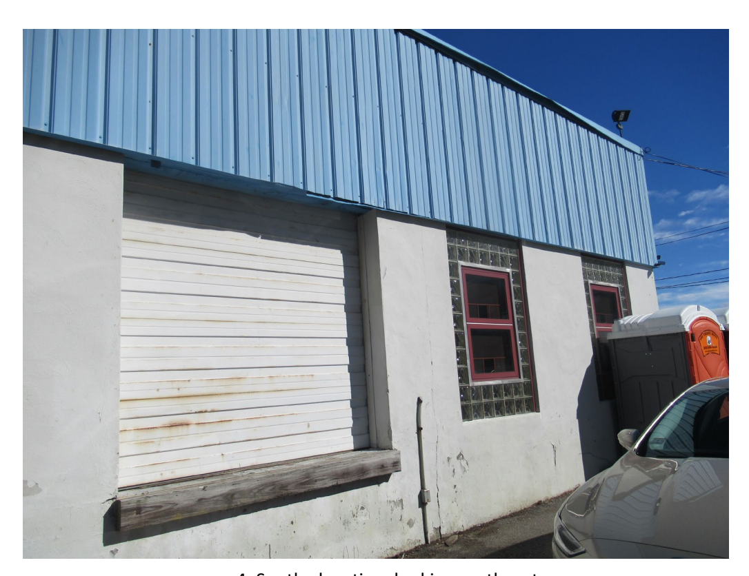
4. South elevation, looking northeast