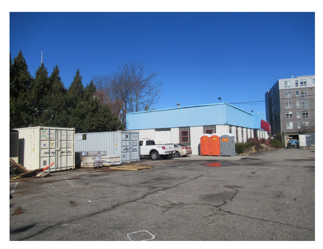
2. South and east elevations, looking north