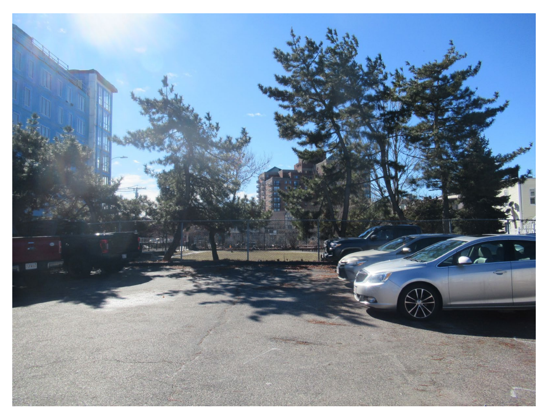
3. Southern portion of parcel, looking south