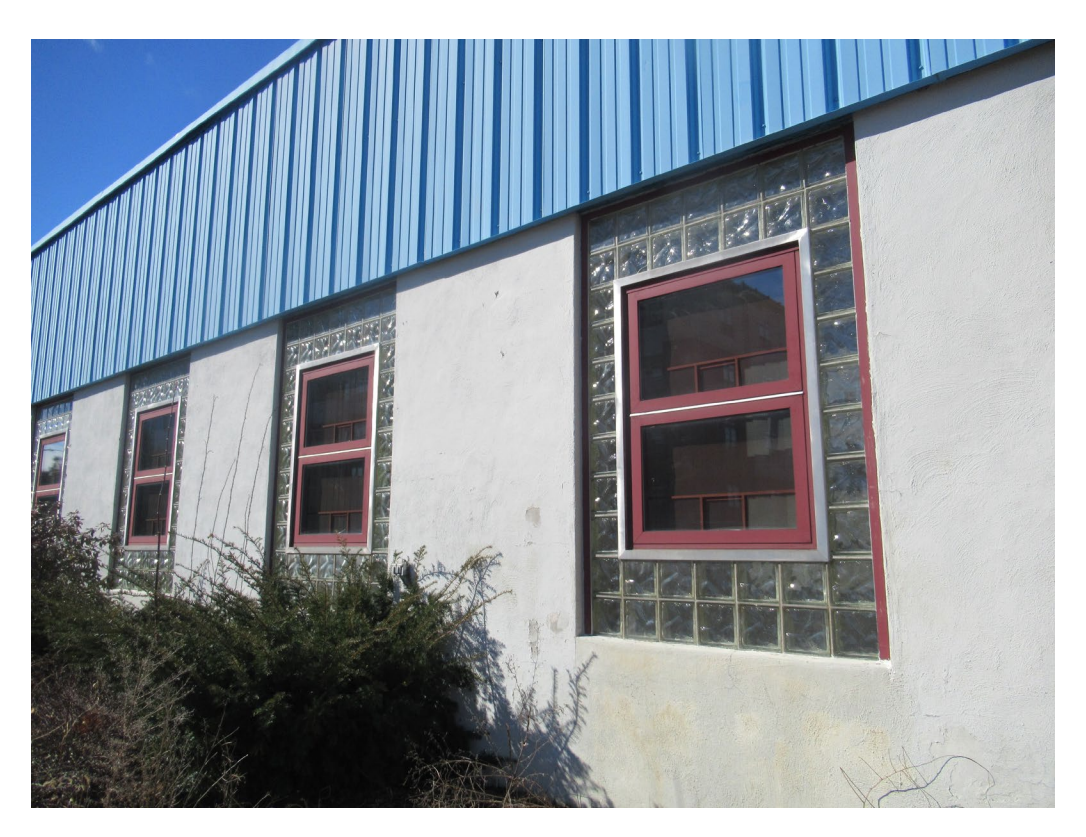
12. Window detail