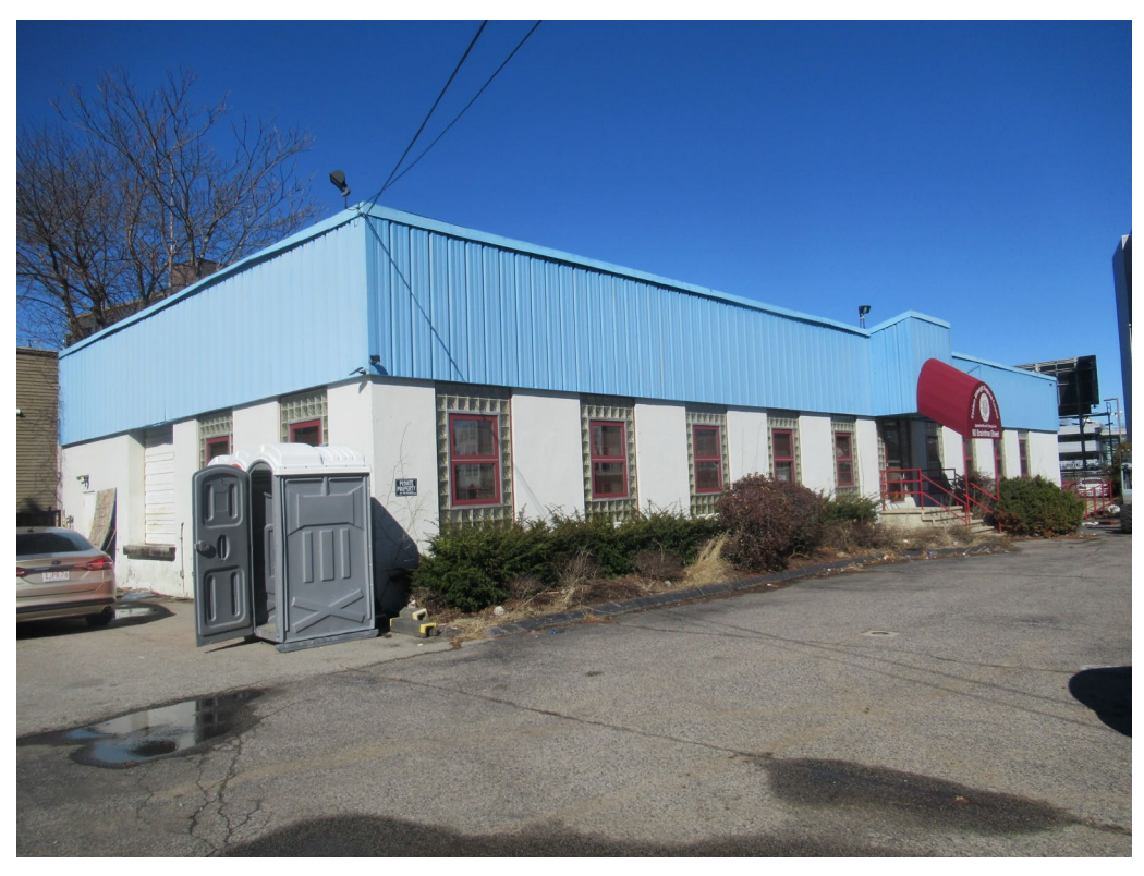
1. East elevation (façade) and south elevations, looking north