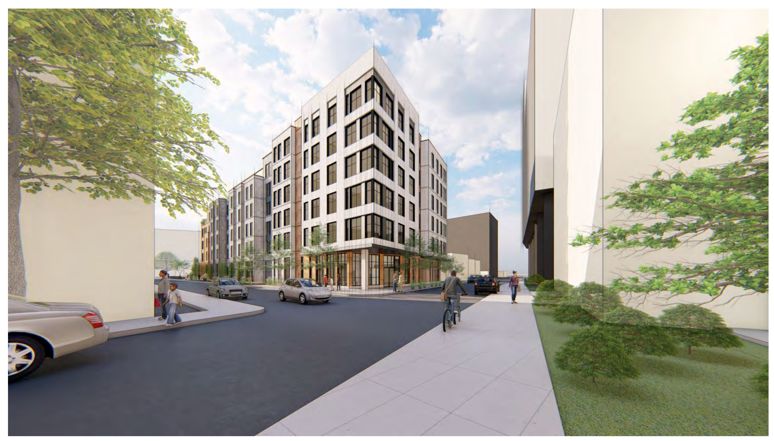
VIEW FROM BRAINTREE STREET