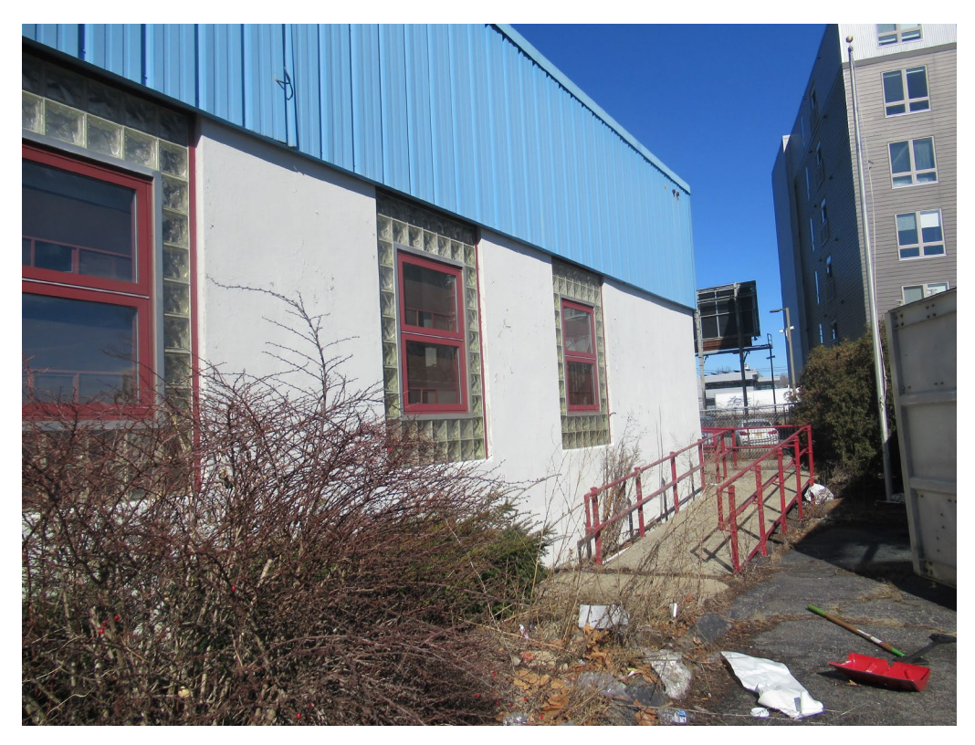
7. East elevation, looking northeast