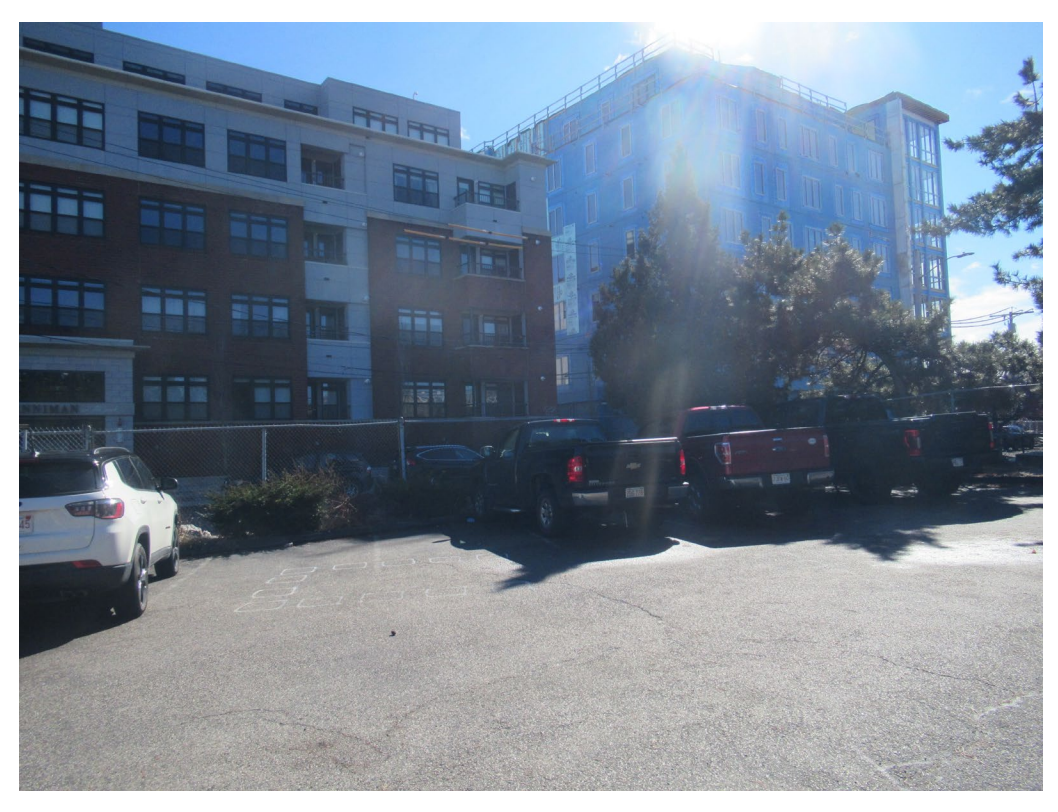
5. Southeastern portion of parcel, looking southeast