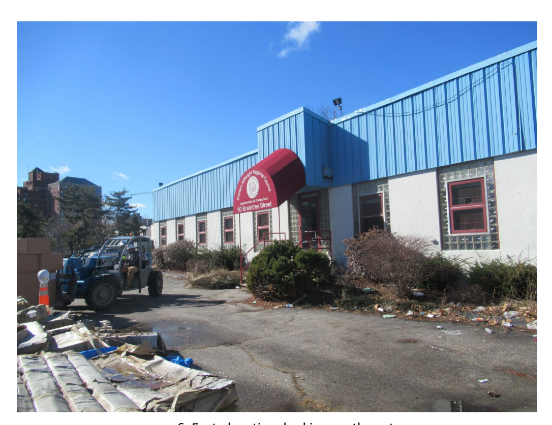
6. East elevation, looking southwest