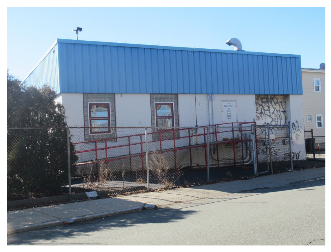
9. North elevation, looking southwest