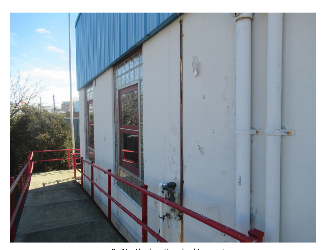
8. North elevation, looking east