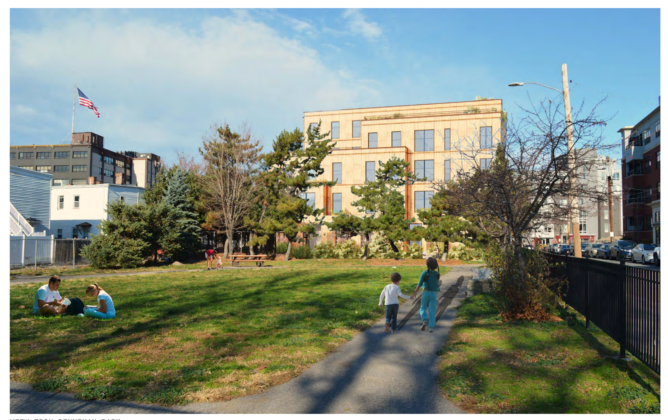
VIEW FROM PENNIMAN PARK