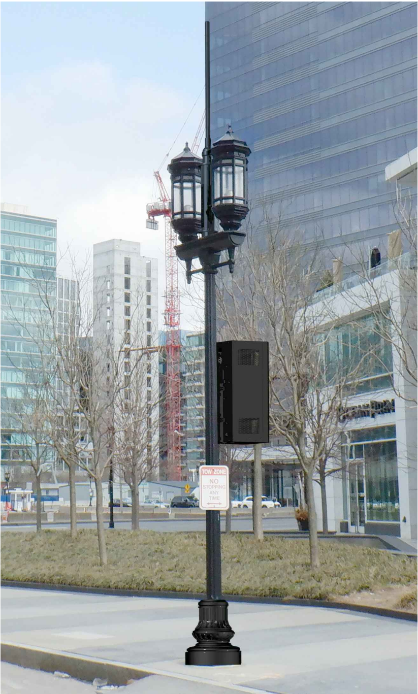
PROPOSED PHOTOGRAPHIC SIMULATION