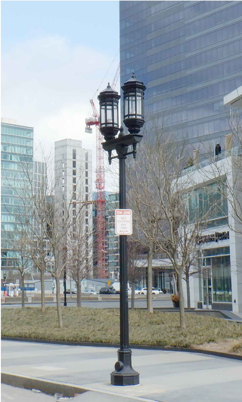
EXISTING PHOTOGRAPHIC VIEW