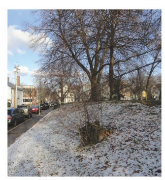
5. EXISTING TREE STUMP BASAL SPROUTS