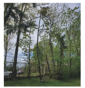
2. PINE SPARSE; UNBALANCED CROWN