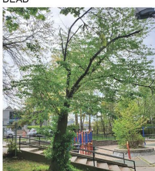
15. YOSHINO' CHERRY DEAD LIMBS