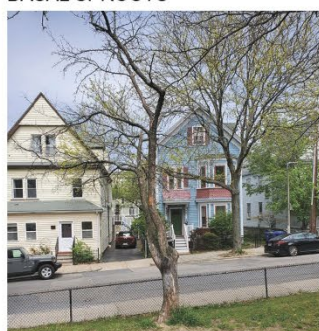
10. CRABAPPLE DEAD