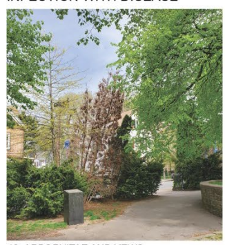
12. ARBORVITAE AND YEWS DEAD; DYING