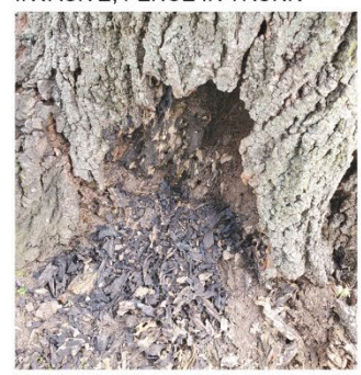
9. LINDEN TRUNK DEAD/DECAY ROT