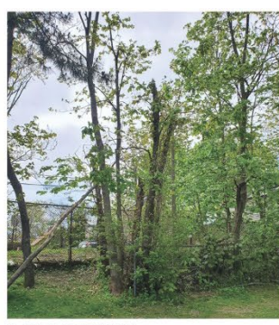
3. TREE OF HEAVEN INVASIVE; WEAK WOODED