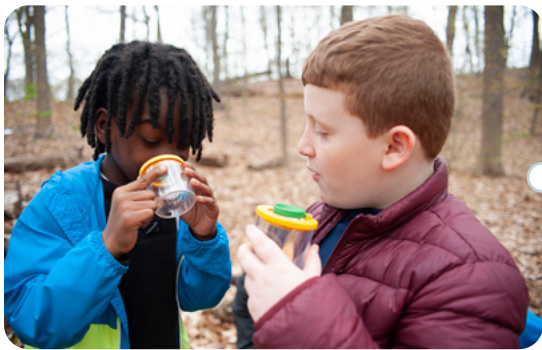
BPS students explore the Arboretum.

Harvard University offers many educational and mentorship programs in the STEM field for Boston Public Schools (BPS) that aim to expand opportunities to learn and to be inspired by the study of sciences.