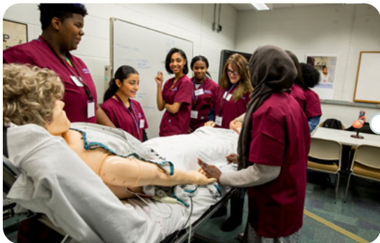
Students in the MEDscience program at Harvard Medical School study a cardiovascular case.

The Arnold Arboretum, for example, offers programs for BPS students, grades Pre-K–5, to investigate biodiversity in the meadows, ponds, and woodlands, and engage in hands-on exploration of organisms and seasonal phenomena. The Arboretum coordinates with teachers to make sure the content supports classroom learning goals. The programs align with Boston Public School Life Science study and Massachusetts Science, Technology, and Engineering Standards.