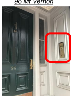
96 Mt Vernon