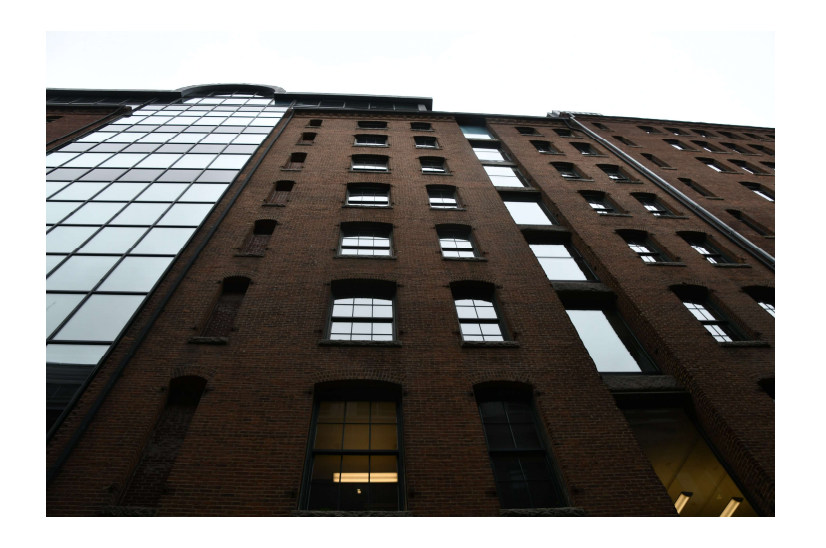
Rear Alley Elevation