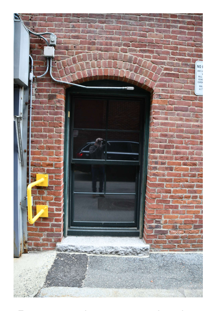
Existing wood trim surrounding the aluminum window systems.