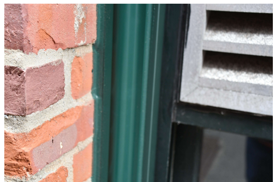
Close-ups Metal Mockup; Note the sealant joint between the masonry and aluminum will lose its shine as time passes.