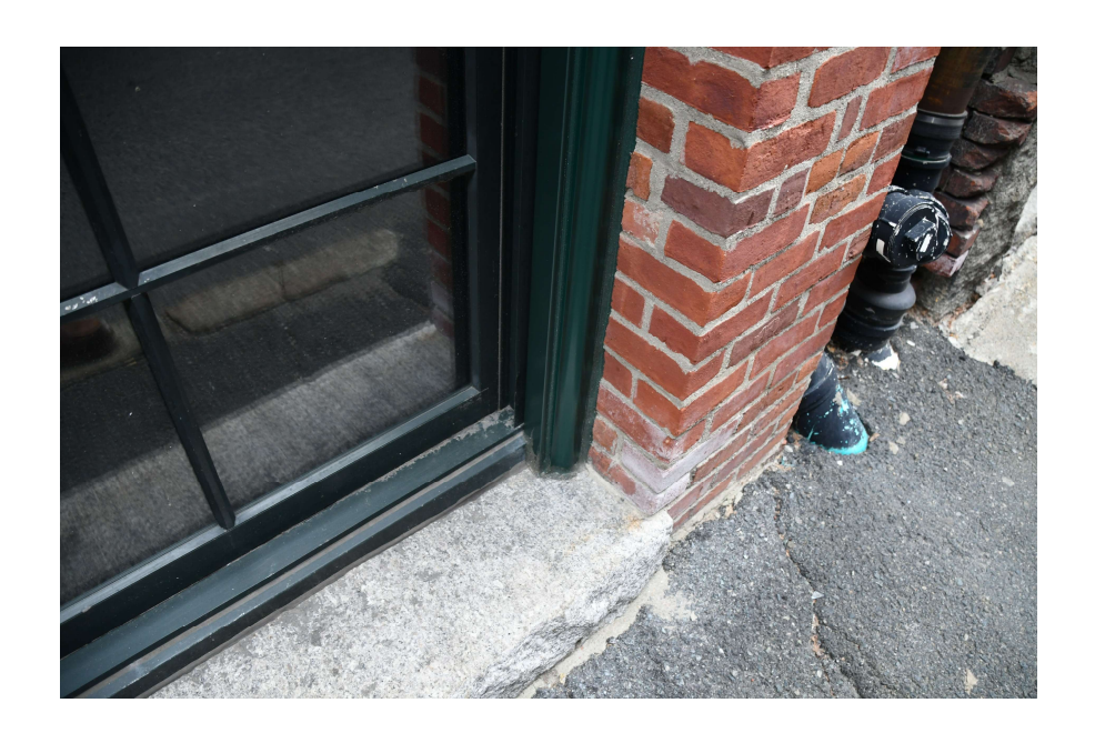
Close-up photograph of aluminum trim mockup