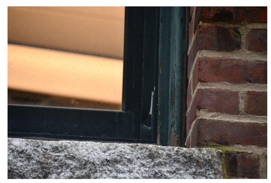
Close-up of existing wood molding. Front Elevation left and Rear Elevation right.