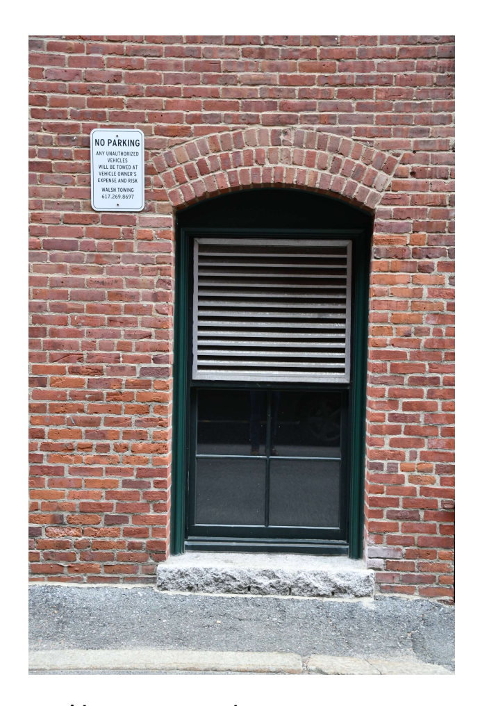
Aluminum window panning trim installed over original wood trim; Window Mockup