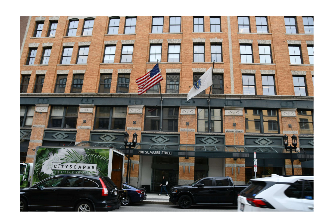
Front Elevation (Summer Street)