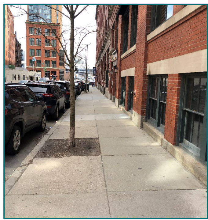
Existing Melcher Street tree pits.