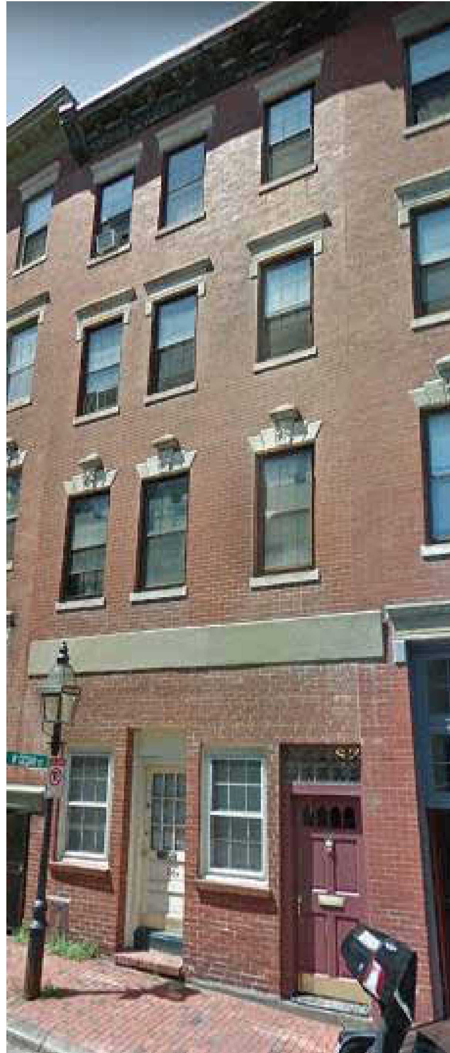
3 84 W CEDAR ST 3" = 1'-0"