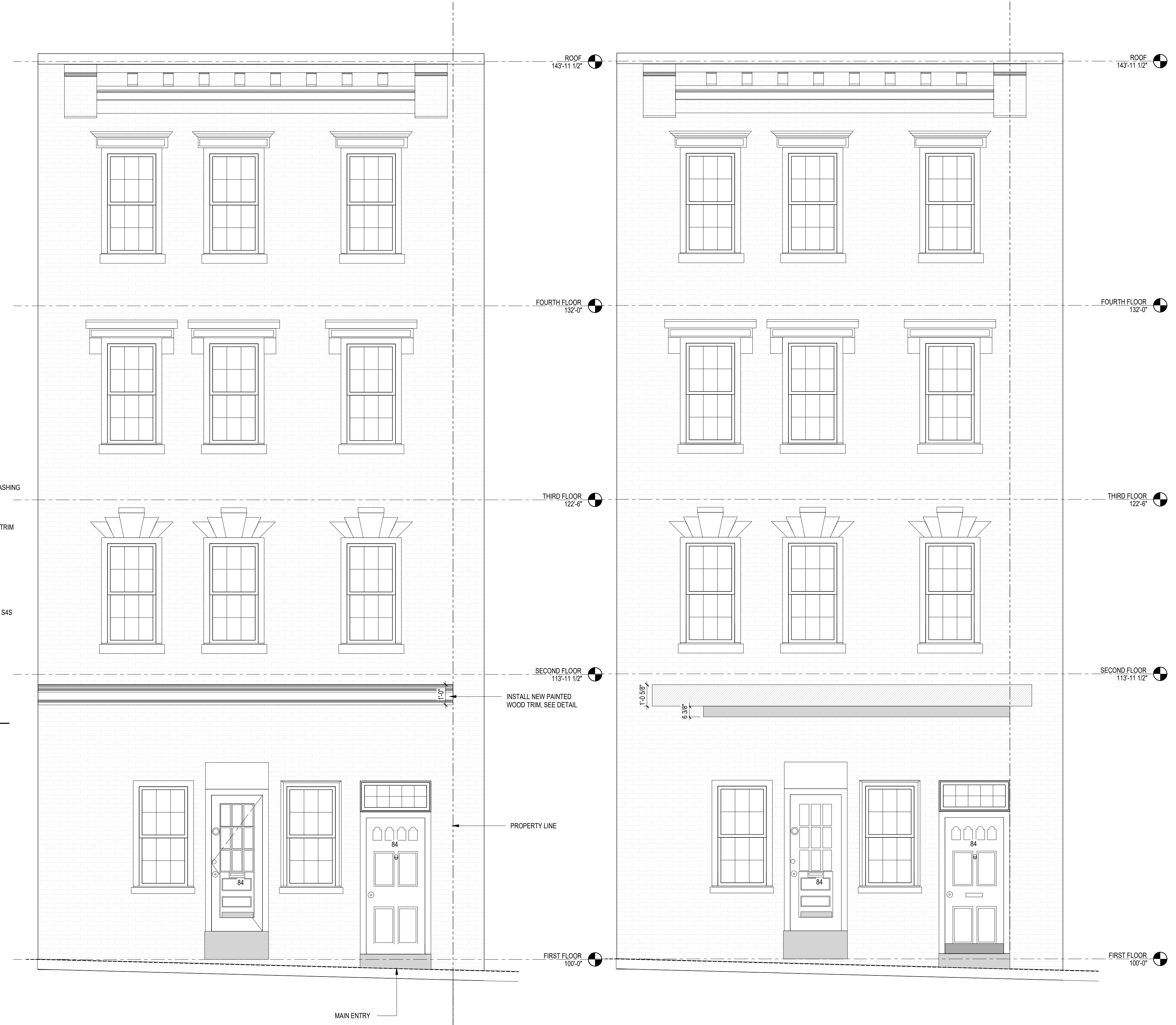
2 SOUTH PROPOSED 3/8" = 1'-0"