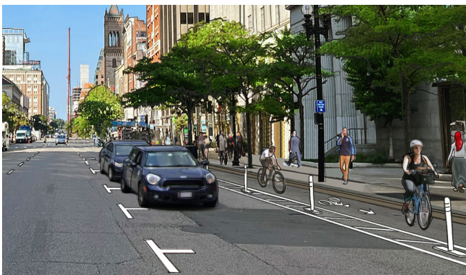
Una futura ciclovía en Boylston Street