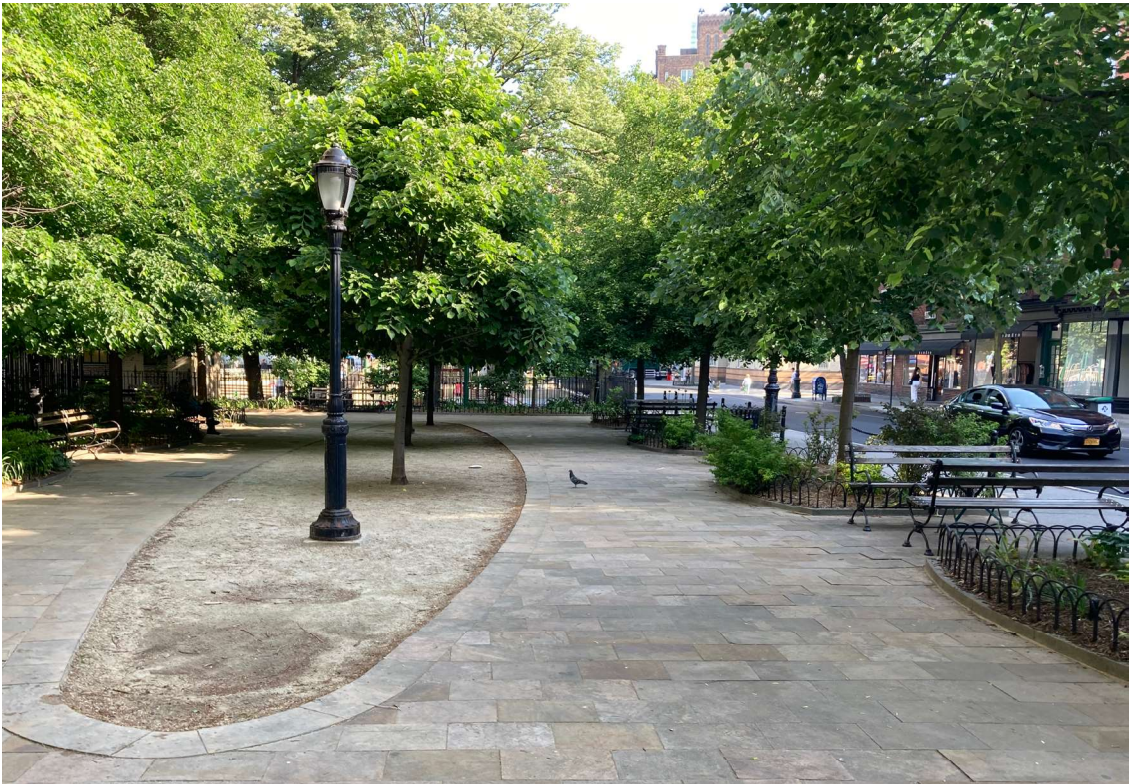
POROUS EDGE PROVIDES COMMUNITY GATHERING OPPORTUNITY (BLEECKER & W. 11TH, NYC)