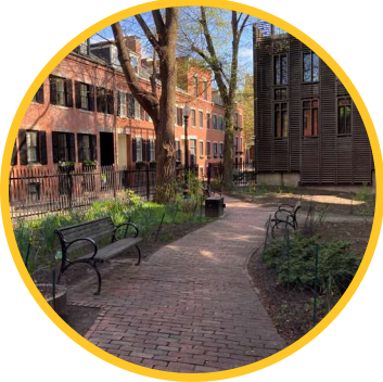
VIEW FROM WITHIN PARK