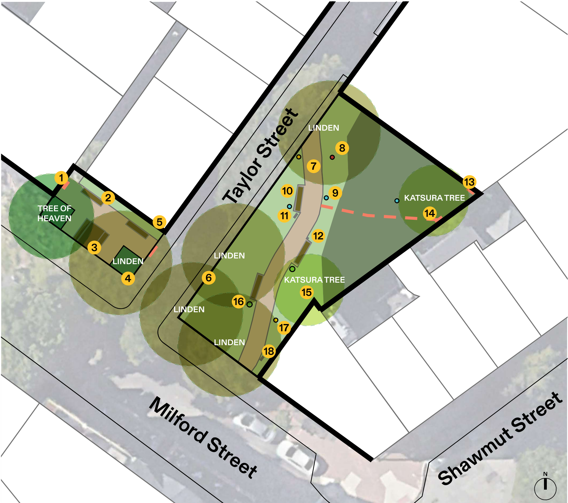
SITE INVENTORY PLAN