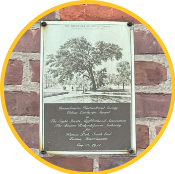
HISTORIC PARK PLAQUE