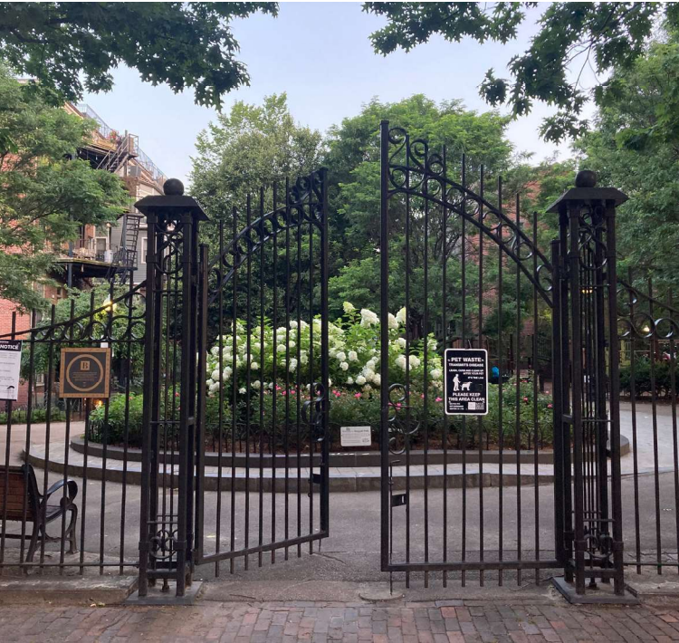
RINGGOLD PARK ENTRY