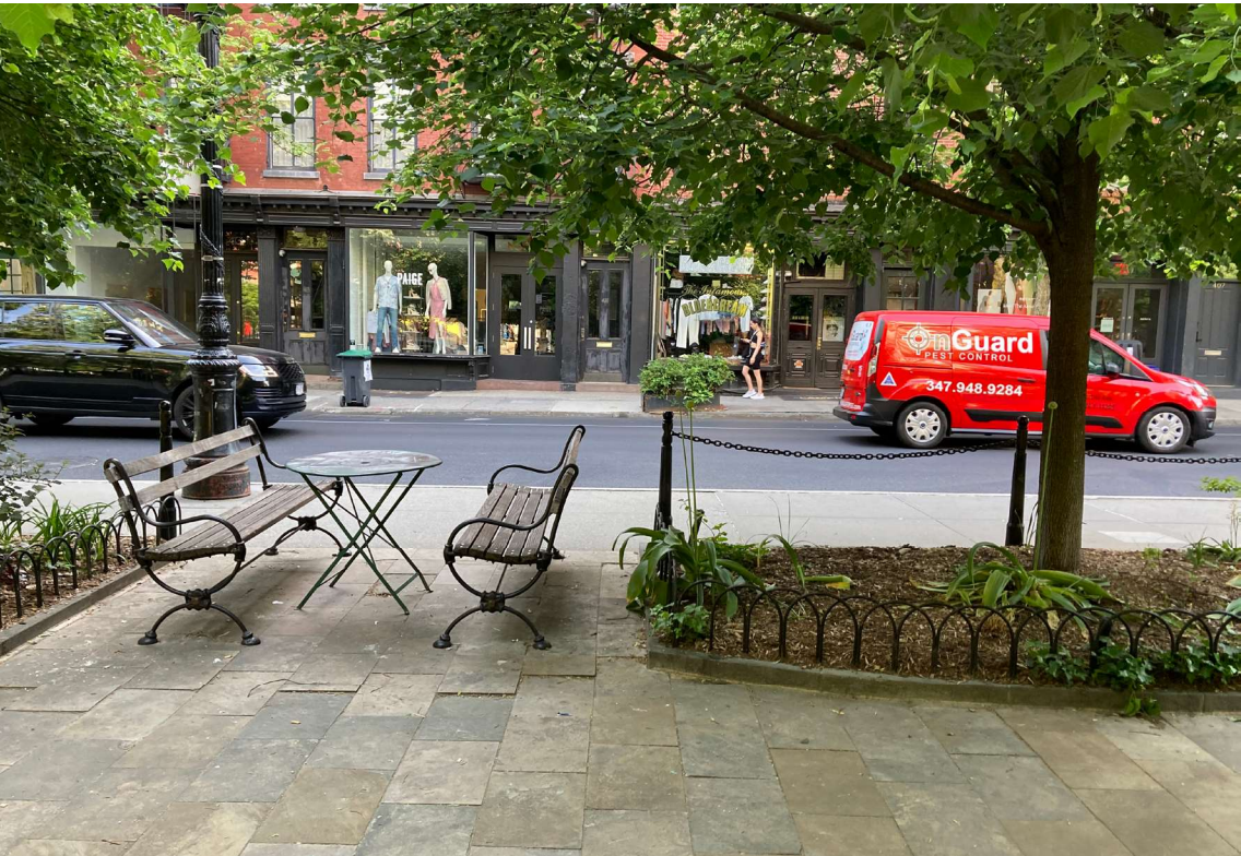
POROUS PARK EDGE SHARES THE EXPERIENCE OF NICELY SCALED BLEECKER STREET (BLEECKER & W. 11TH, NYC)