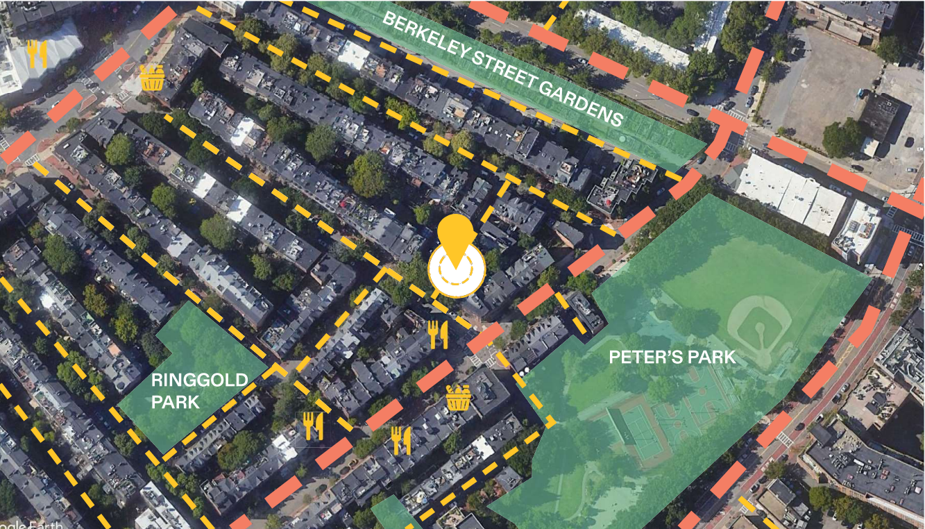
NEIGHBORHOOD SCALE LOCUS MAP