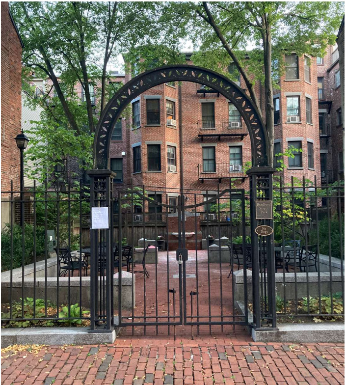
BRADFORD STREET PARK ENTRY