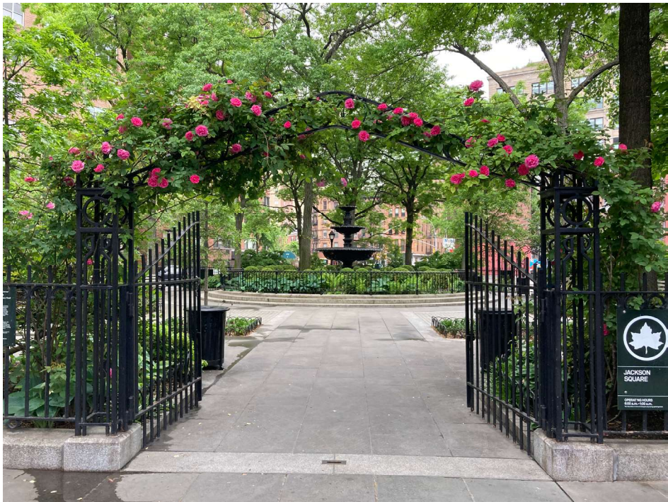
JACKSON SQUARE PARK ENTRY, NYC