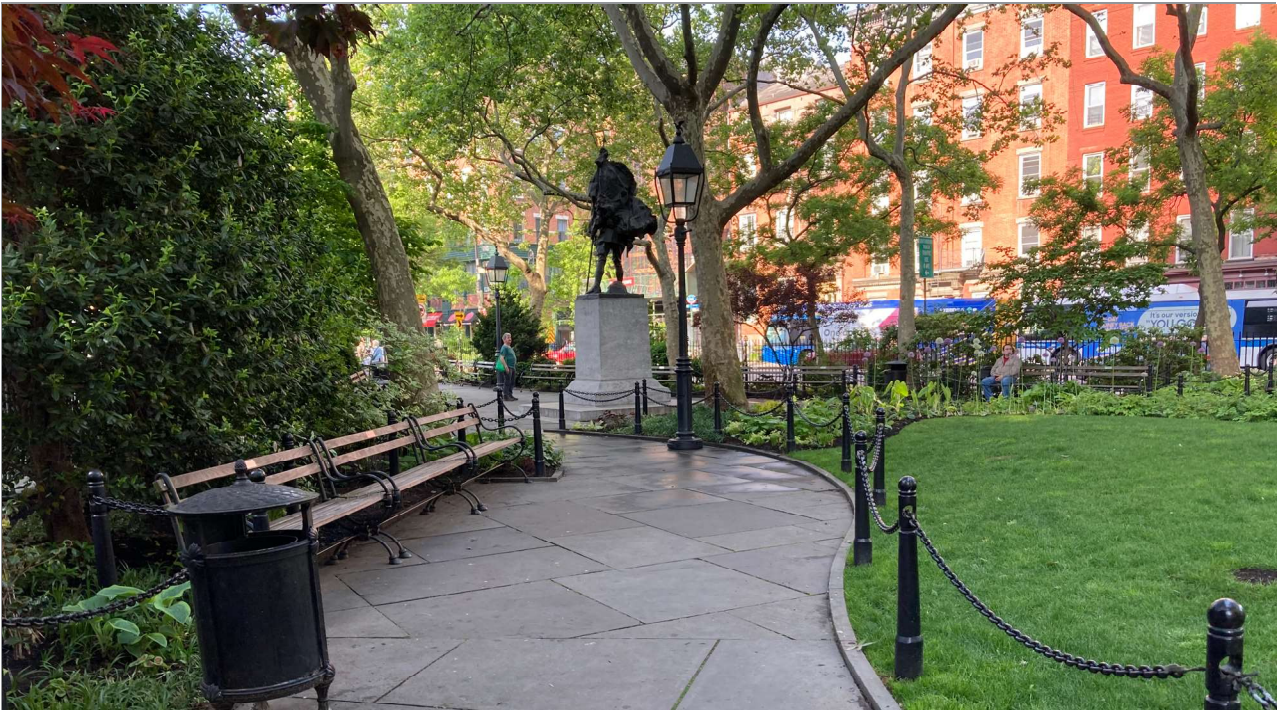
PASSIVE PARK AND LONG BENCHES (ABINGDON SQUARE, NYC)