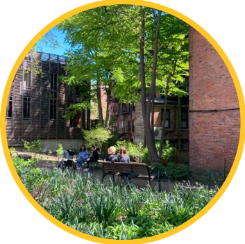
PARK VIEW FROM TAYLOR ST.