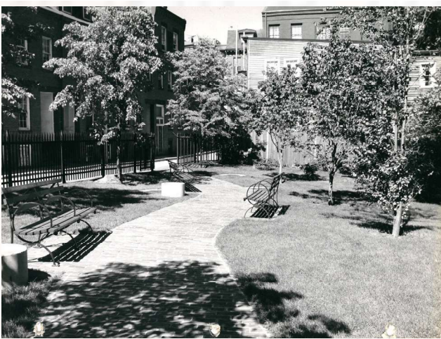
WATSON PARK, 1970'S