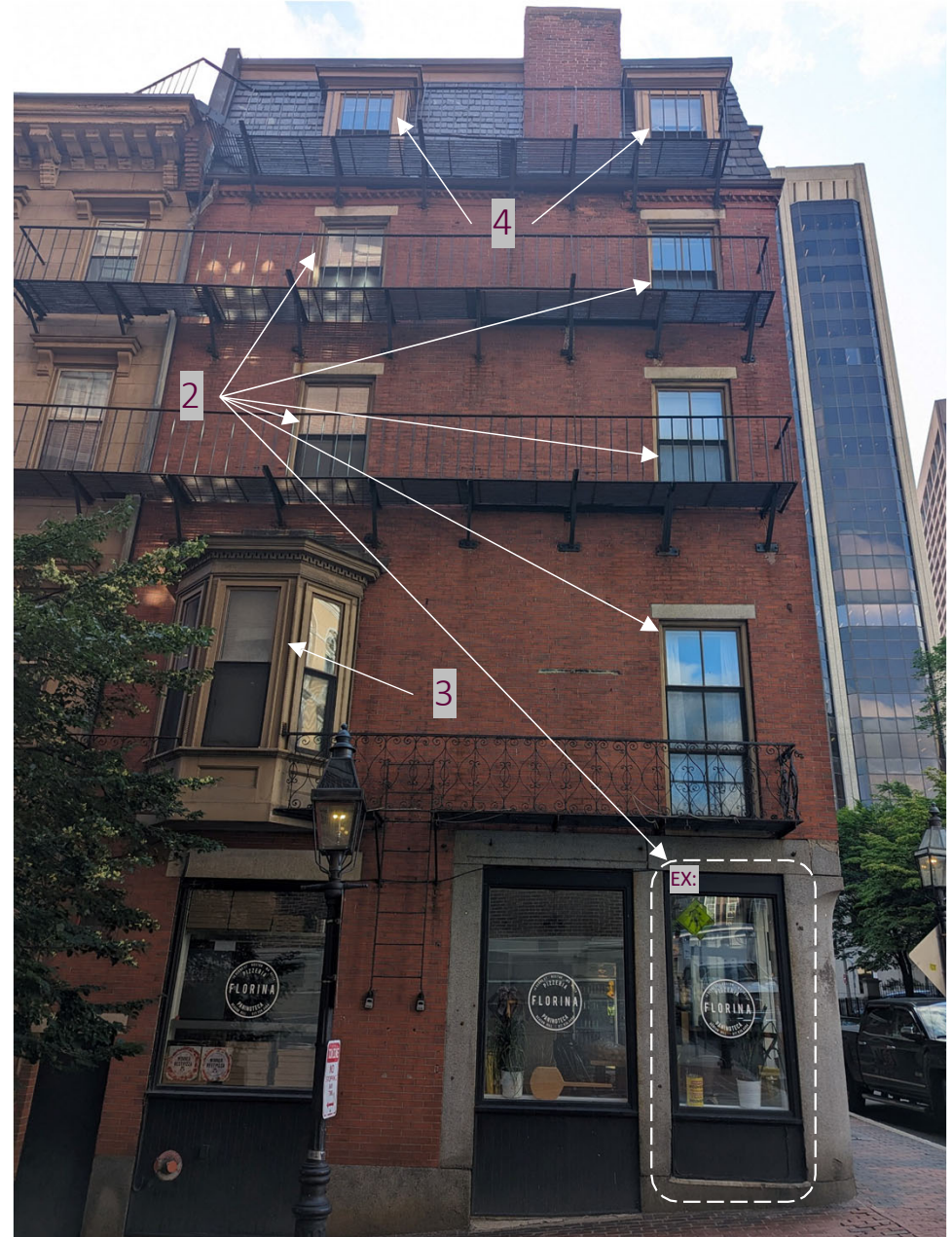
→ 58 Temple St Dormers