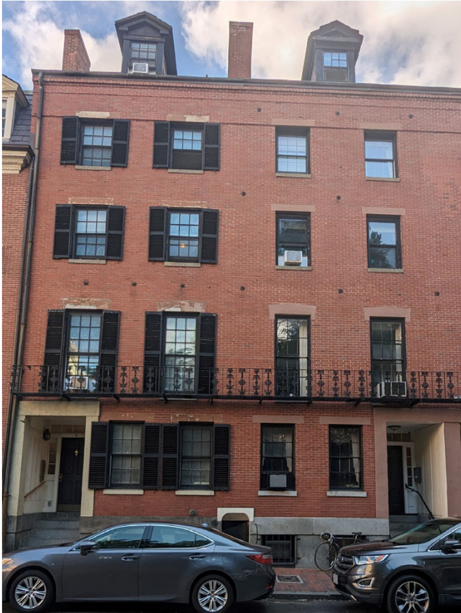
EX: 4 & 6 Derne St – Black Painted Window Trims and Dormers