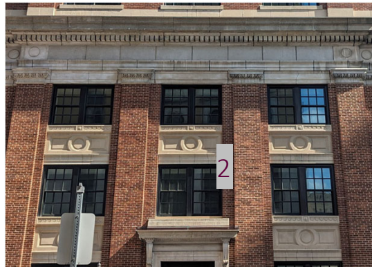
→ 20 Derne St Windows