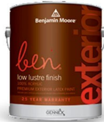
Benjamin Moore ben Exterior Latex Paint Low Lustre Finish (542)

Cleanup: Soap and Water Resin Type: 100% Acrylic Latex Recommended Use: Exterior MPI Rating: 15 VOC Level: 45.0