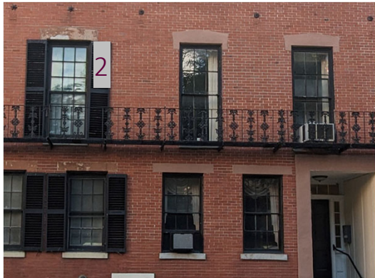
← 4 & 6 Derne St Windows

2 – Paint all door and window wood trims with exterior-grade, semi-gloss, black paint. (To match existing historic buildings in immediate vicinity.)