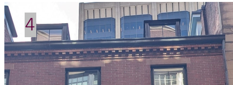
← 4 & 6 Derne St Dormers