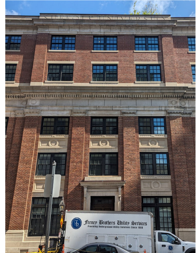
EX: 20 Derne St – Black Painted Window Trims