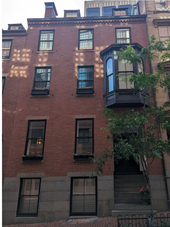
EX: 58 Temple St – Black Painted Bay Window, Window and Door Trims, and Dormers