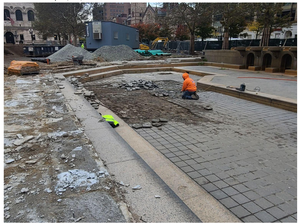
Hand\ removal\ of\ the\ fountain\ basin\ tiles\ will\ allow\ us\ to\ reuse\ those\ in\ good\ condition.