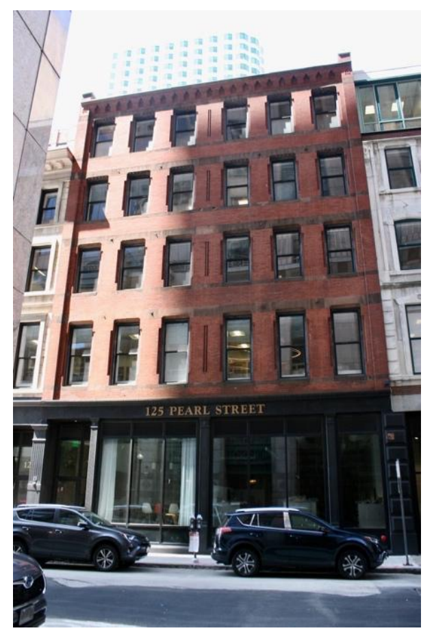
Figure 13 . 115–119 Pearl St. façade. Photograph by Wendy Frontiero, June 2023.