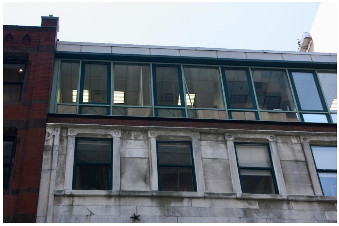
Figure 18. 119 High Street: Penthouse addition. Photograph by Wendy Frontiero, June 2023.