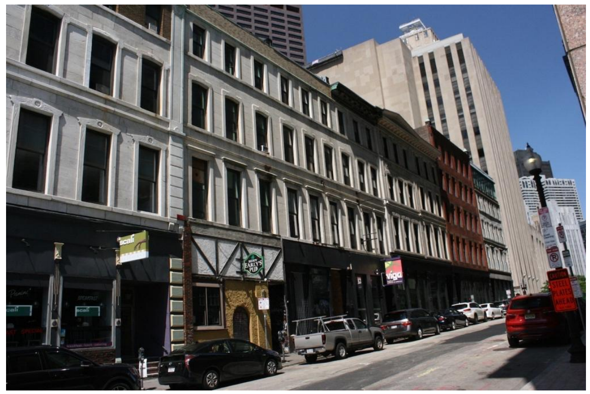
Figure 9. From left, façades at 147-115 Pearl St. and 119 High St. Photograph by Wendy Frontiero, June 2023.