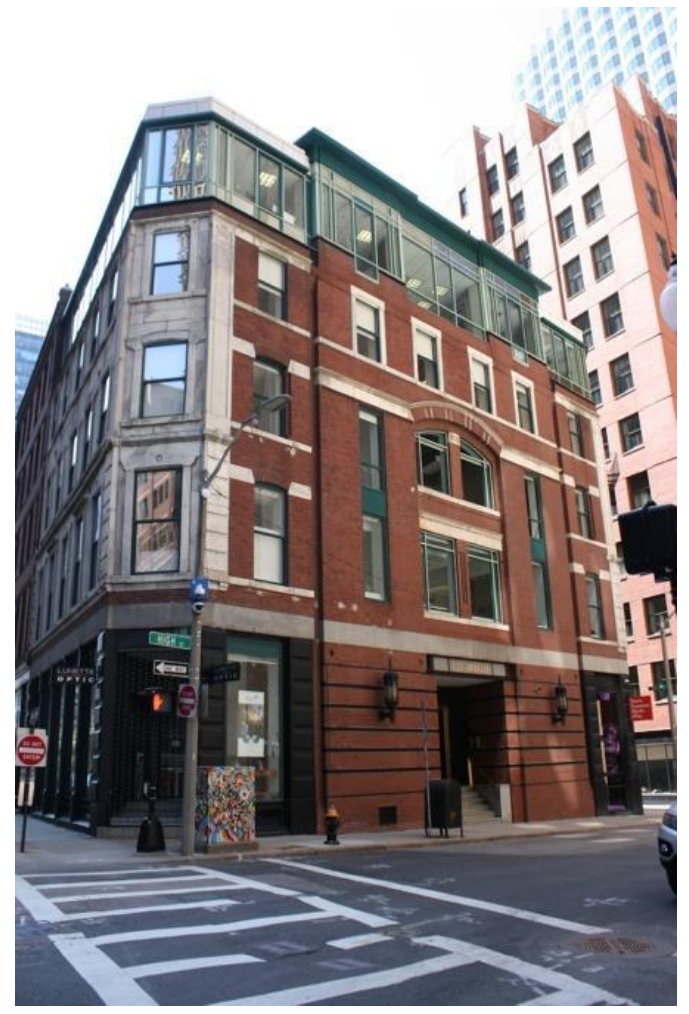
Figure 17 . Façade of 119 High St. Photograph by Wendy Frontiero, June 2023.