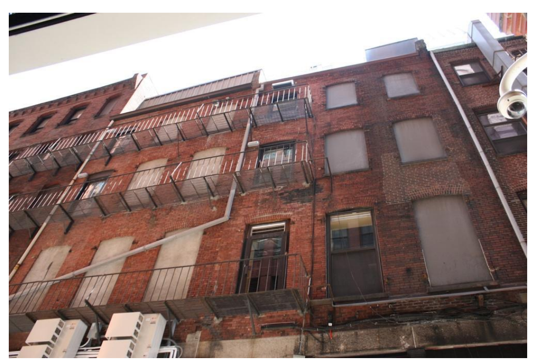
Figure 20 . Gridley Street elevations of 123-127 and 129-131 Pearl St. Photograph by Wendy Frontiero, June 2023.