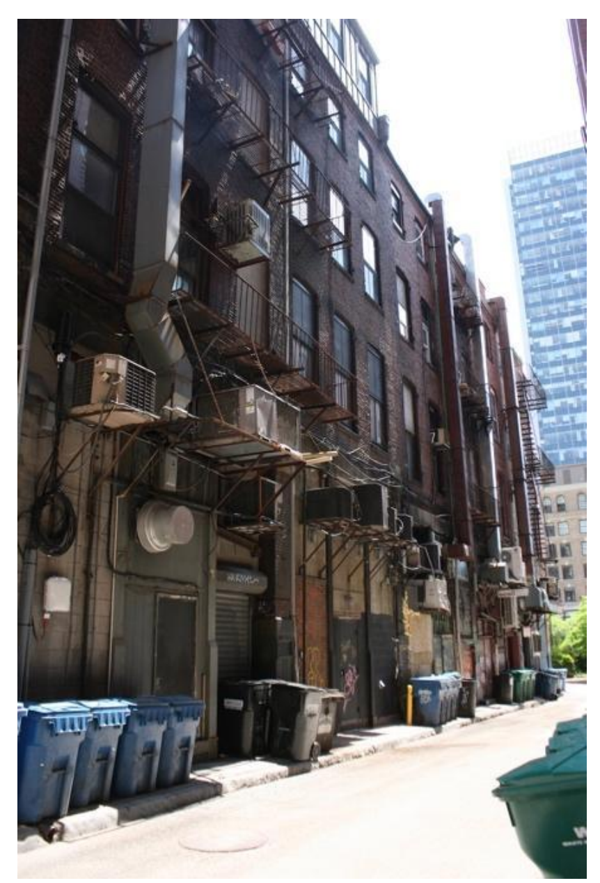
Figure 4. Gridley Street (rear) elevation of the Richardson Block, looking toward Purchase Street. Photograph by Wendy Frontiero, June 2023.