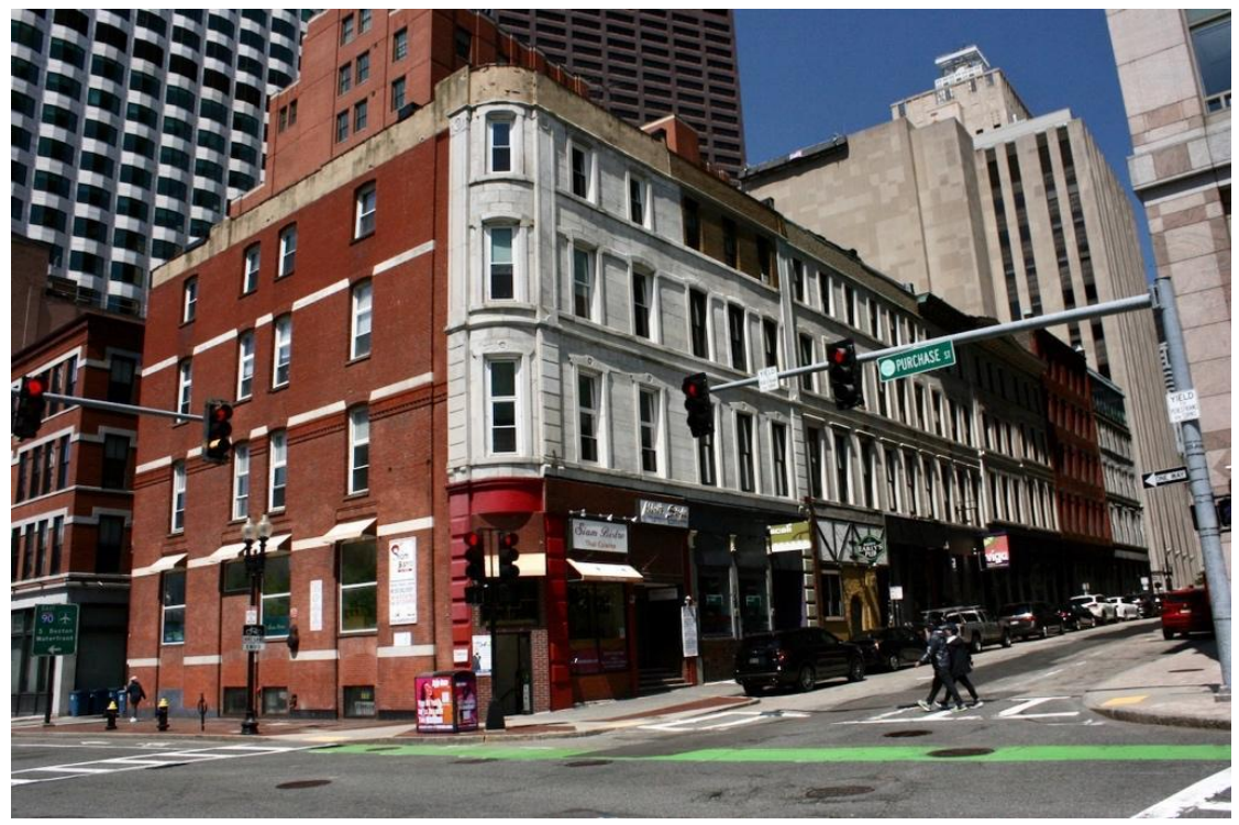
Figure 3. Purchase Street (left) and Pearl Street (right) elevations. Photograph by Wendy Frontiero, June 2023.