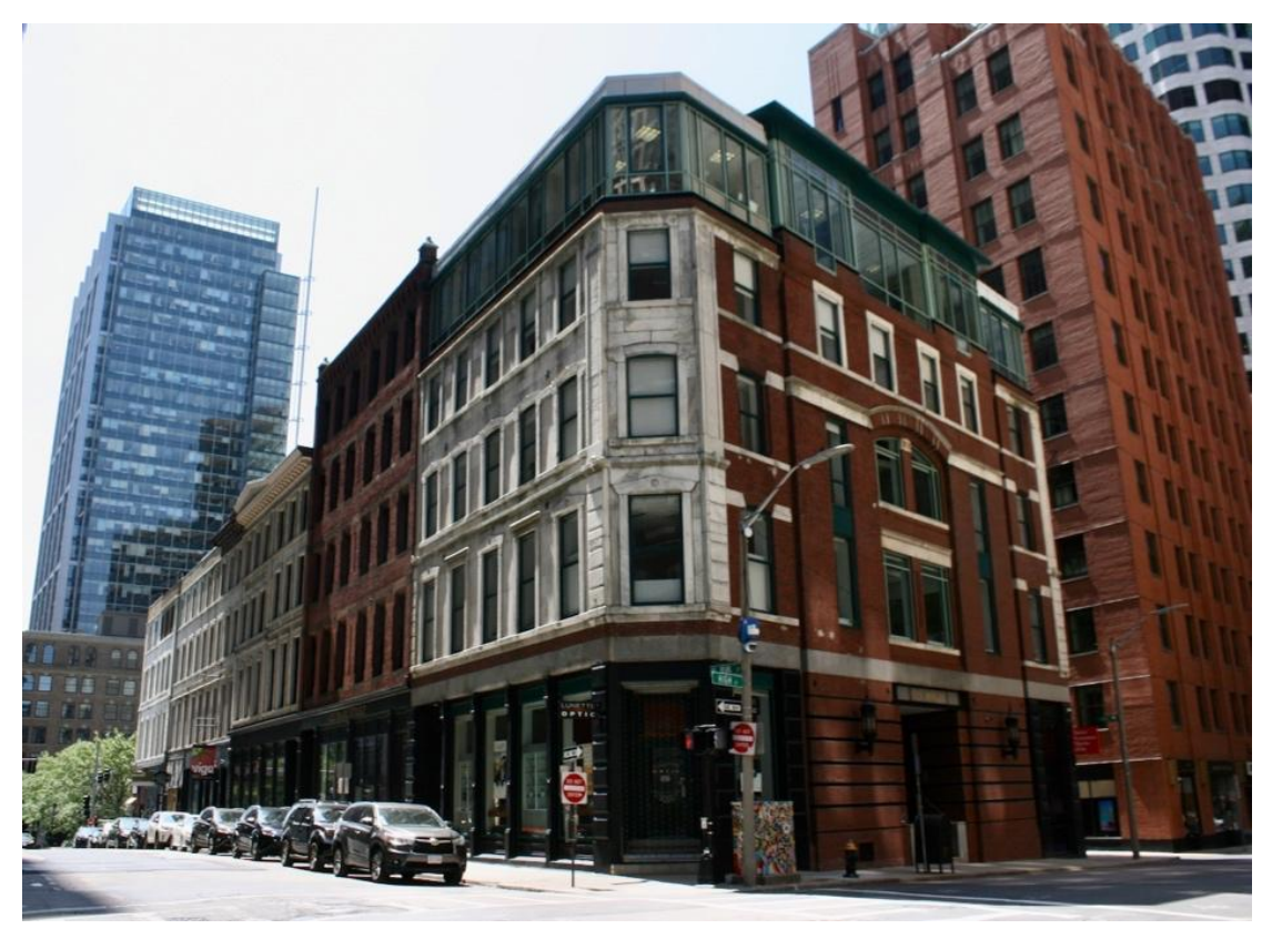
Figure 2. Pearl Street (left) and High Street (right) elevations. Photograph by Wendy Frontiero, June 2023.