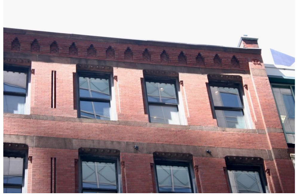
Figure 14. Upper levels and roof edge, 115-119 Pearl St. façade. Photograph by Wendy Frontiero, June 2023.