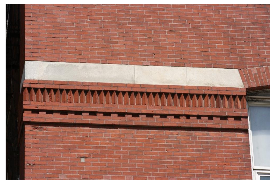
Figure 16 . 149–151 Pearl St., Purchase Street façade detail. Photograph by Wendy Frontiero, June 2023.