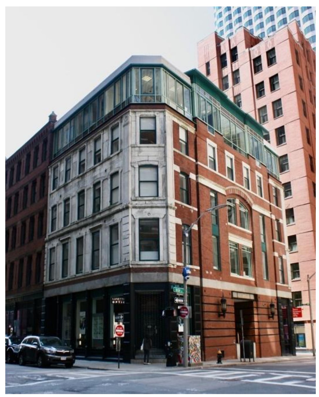
Figure 6 . 119 High St.: Pearl Street (left) and High Street (right) façades. Photograph by Wendy Frontiero, June 2023.