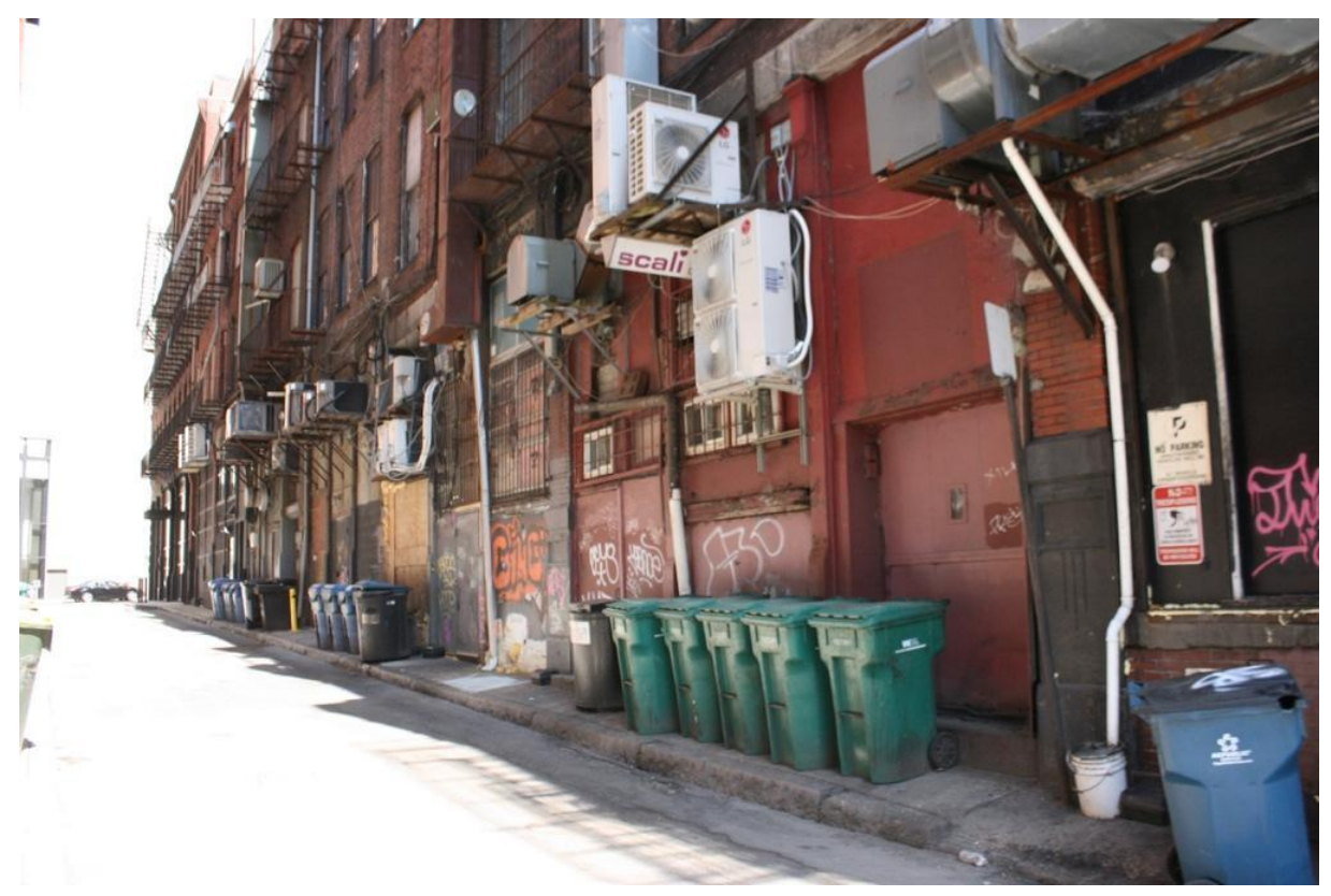
Figure 19 . Gridley Street elevations, looking toward High Street. Photograph by Wendy Frontiero, June 2023.