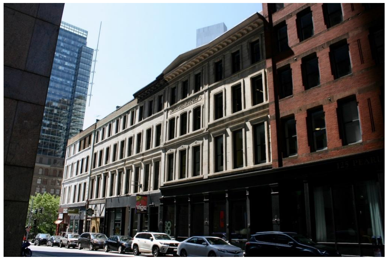
Figure 8. From left 151-115 Pearl St. façades. Photograph by Wendy Frontiero, June 2023.