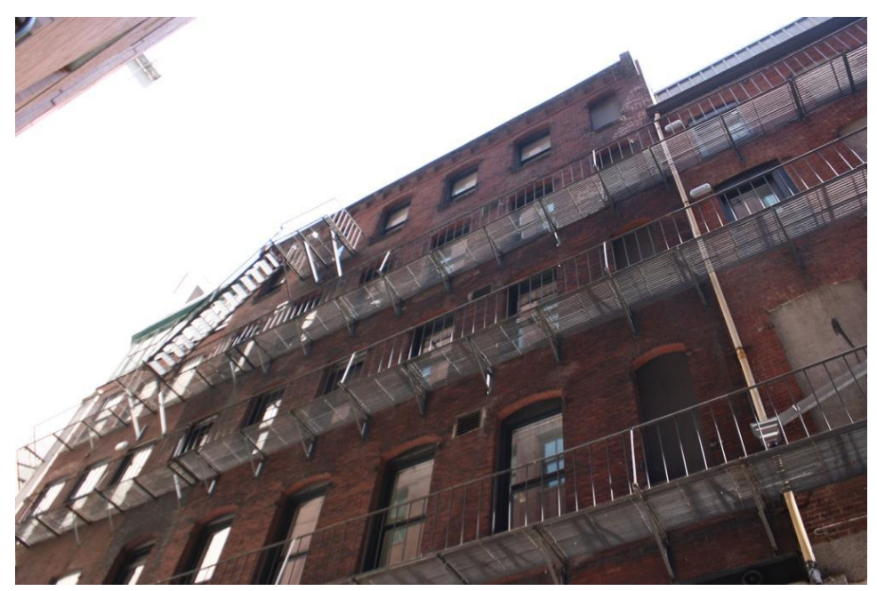
Figure 21 . Gridley Street elevation of 115-119 Pearl St.