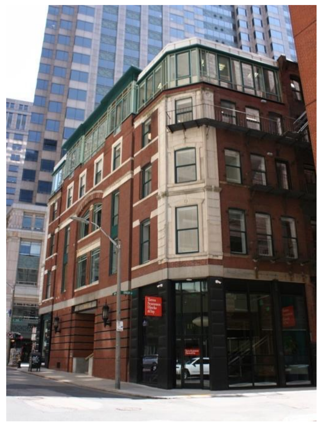
Figure 5. 119 High St. (left) and Gridley Street (right) elevations. Photograph by Wendy Frontiero, June 2023.