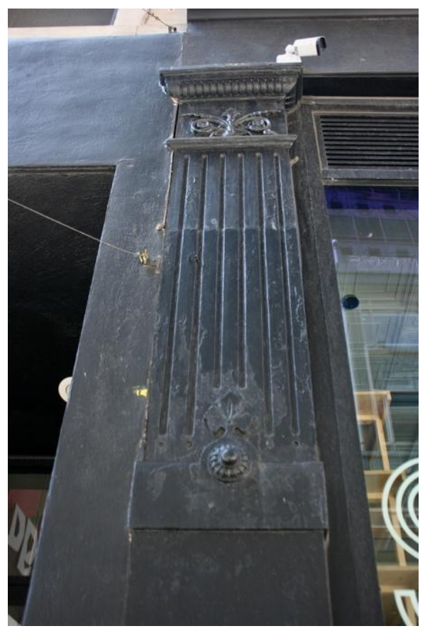
Figure 11 . 129–131 Pearl St. storefront detail. Photograph by Wendy Frontiero, June 2023.