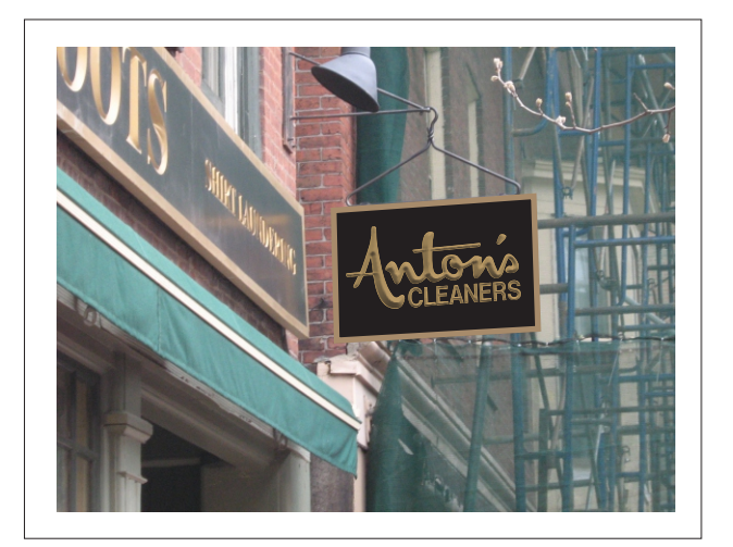
EXISTING CONDITIONS * NOTE - COAT HANGER SHAPED BRACKET *