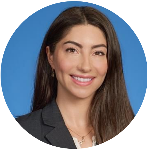
City Councilor, District 1

Will provide updates following this meeting.