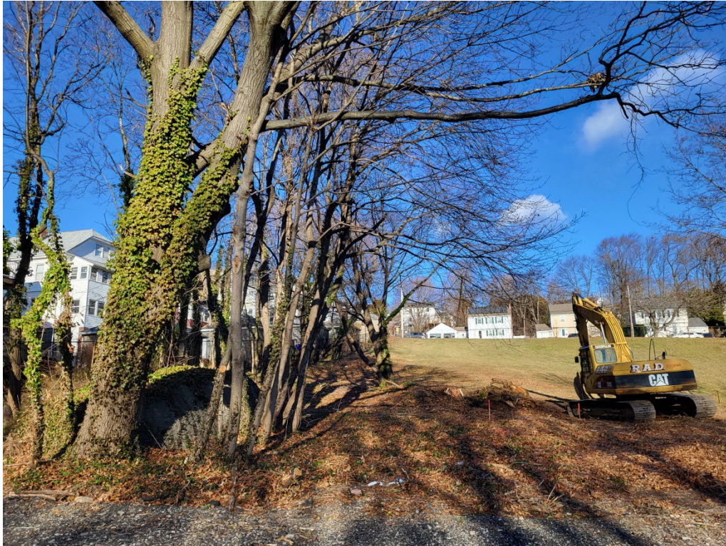
View looking north from the previous location of the tennis court