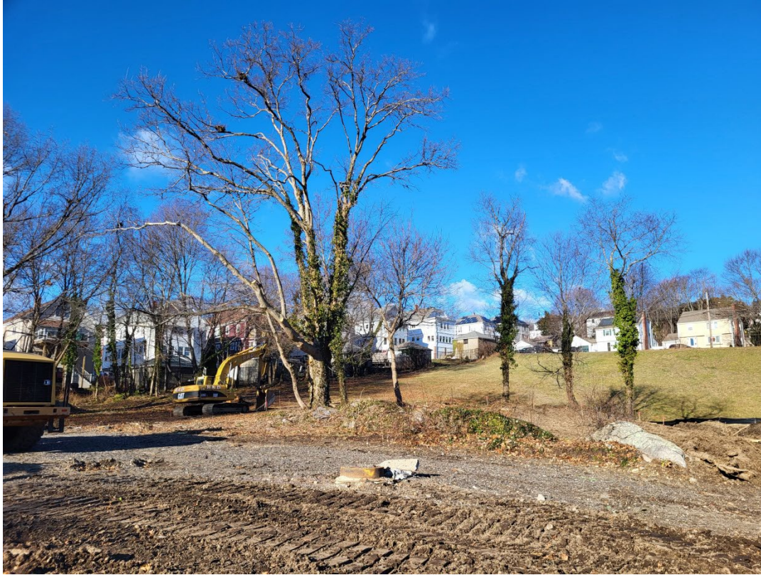
The future basketball court location, looking north