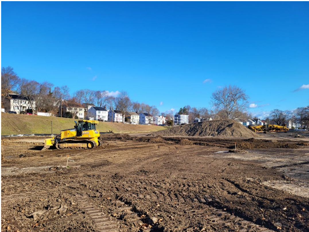
The future multi-purpose field, looking northeast