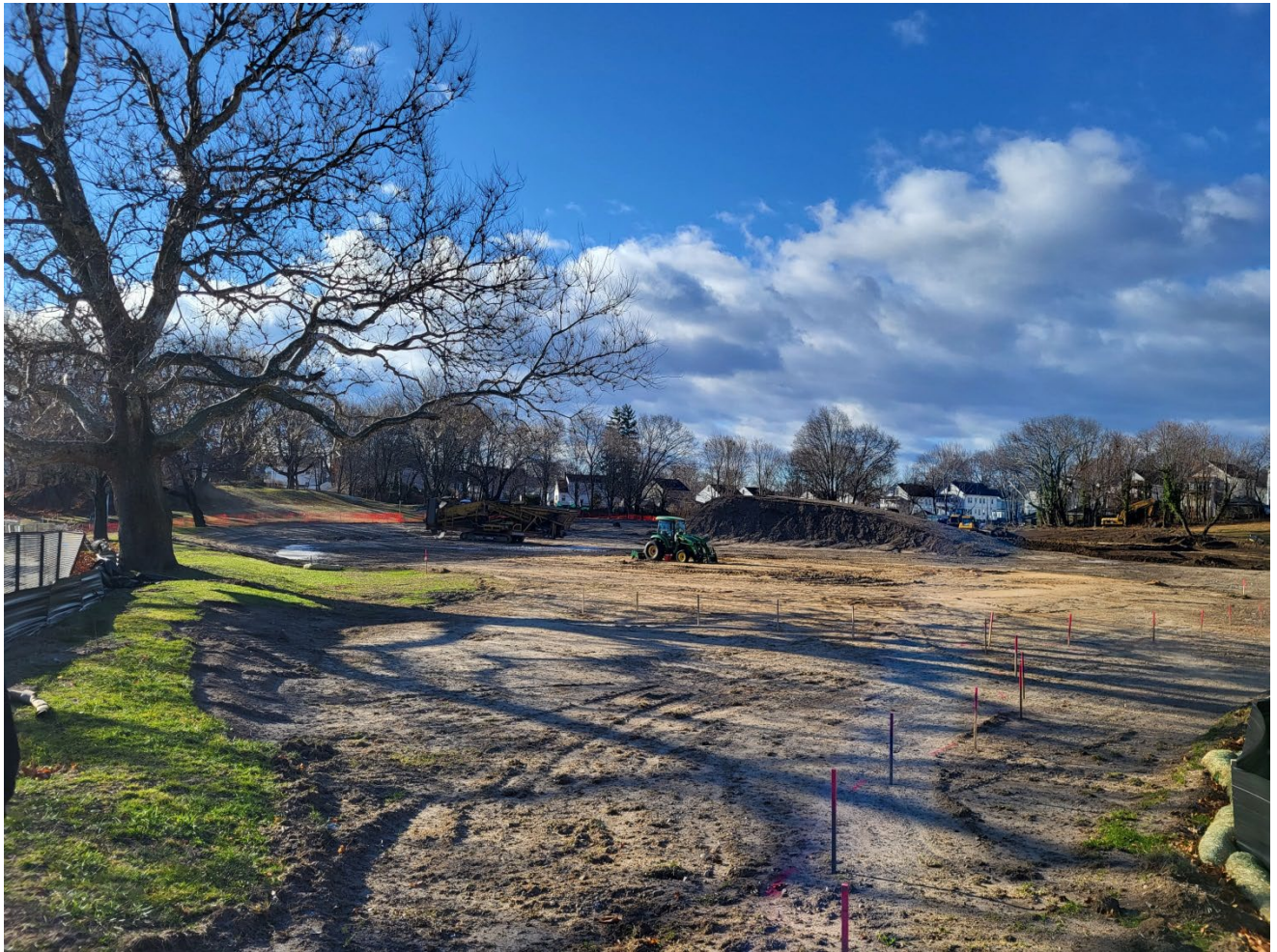
Stakes along the future path, from the entrance at the corner of Washington Street and Clancy Road

Please reach out with any additional questions: amy.linne@boston.gov or 617-961-3045