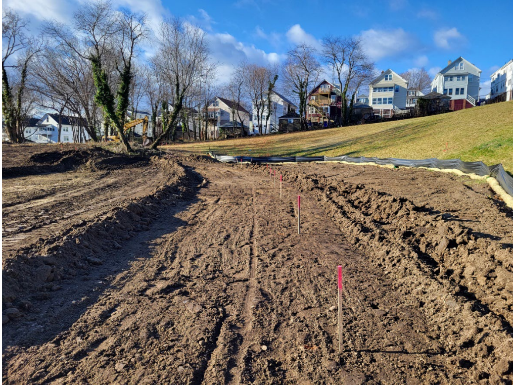
Path alignment looking west towards the sledding hill