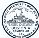
Mayor Michelle Wu Mayor of Boston

A handwritten signature in black ink that reads "Michelle Wu". The signature is fluid and cursive, with the first name and last name clearly distinguishable.