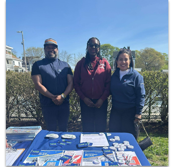
Mattapan Coffee Hour | 4/29/25