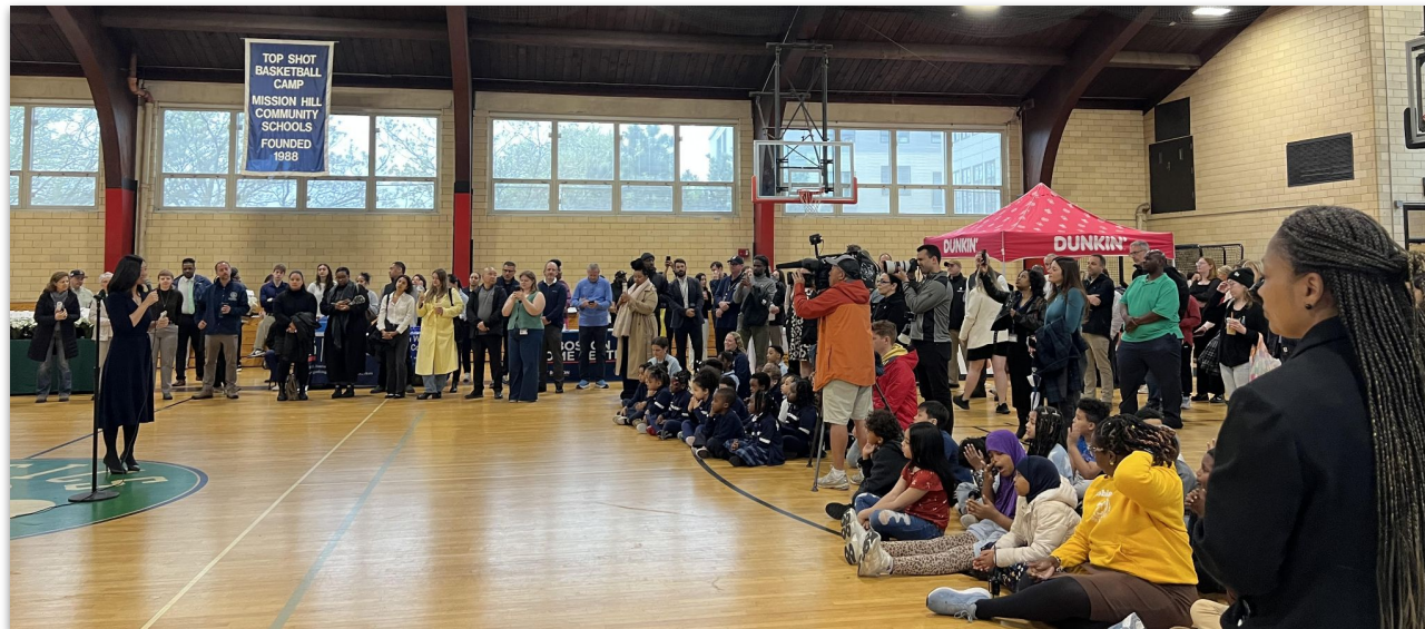
Mission Hill Coffee Hour | May 5, 2025