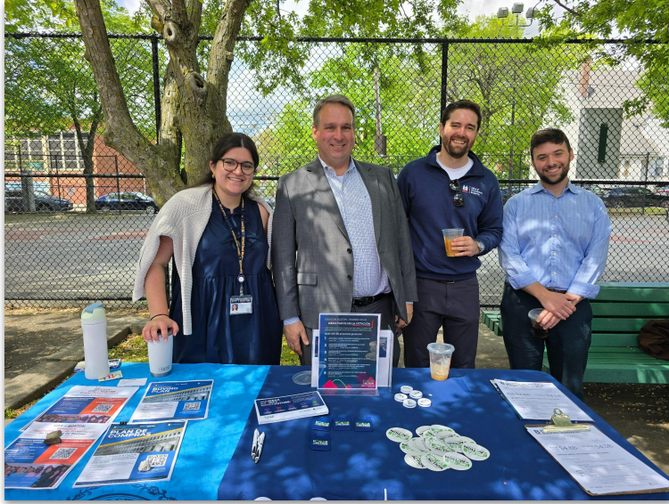
JP Coffee Hour | May 8, 2025