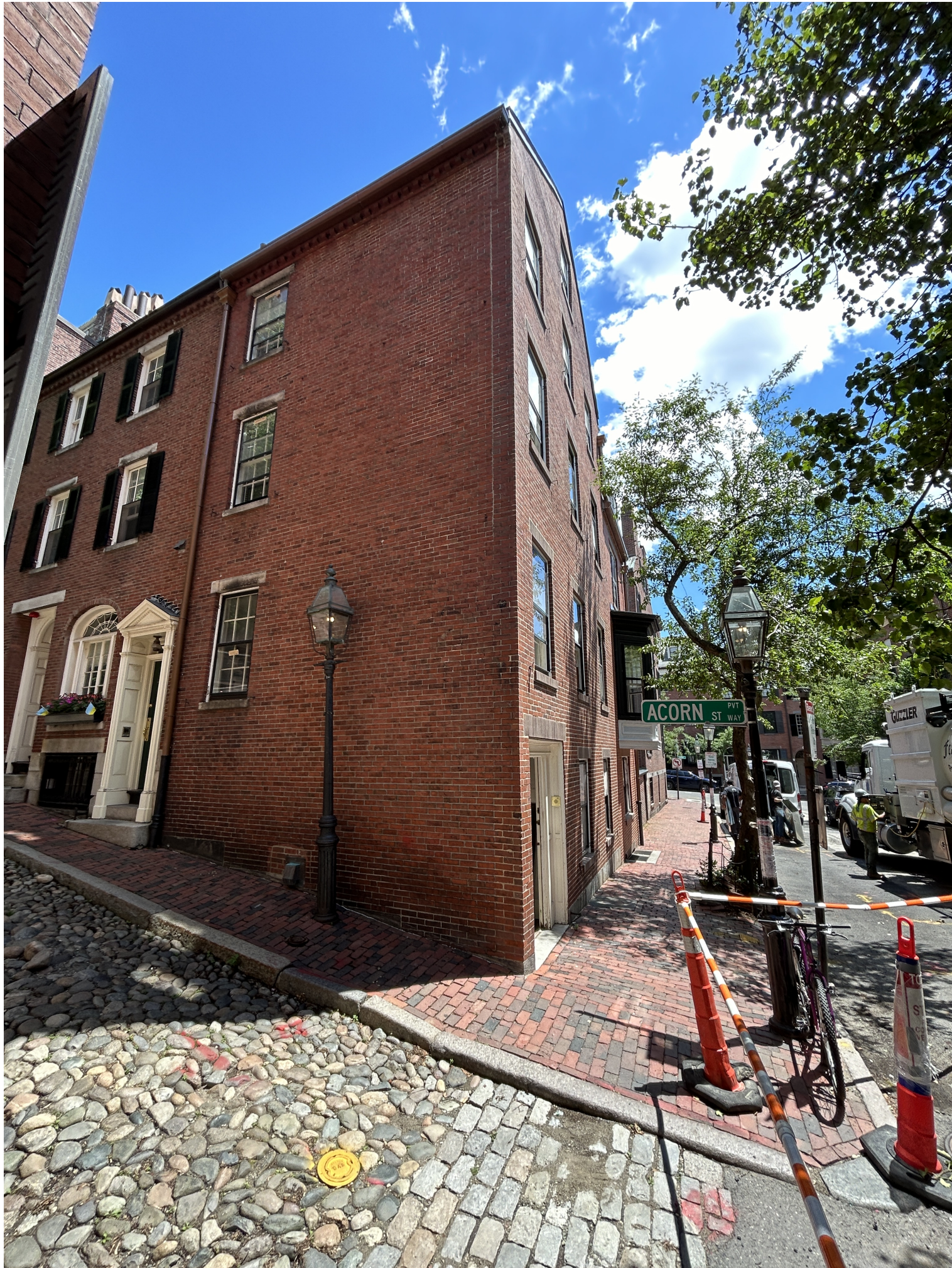
NORTH ELEVATION CORNER OF ACORN AND WEST CEDAR STREET JUNE 27, 2024