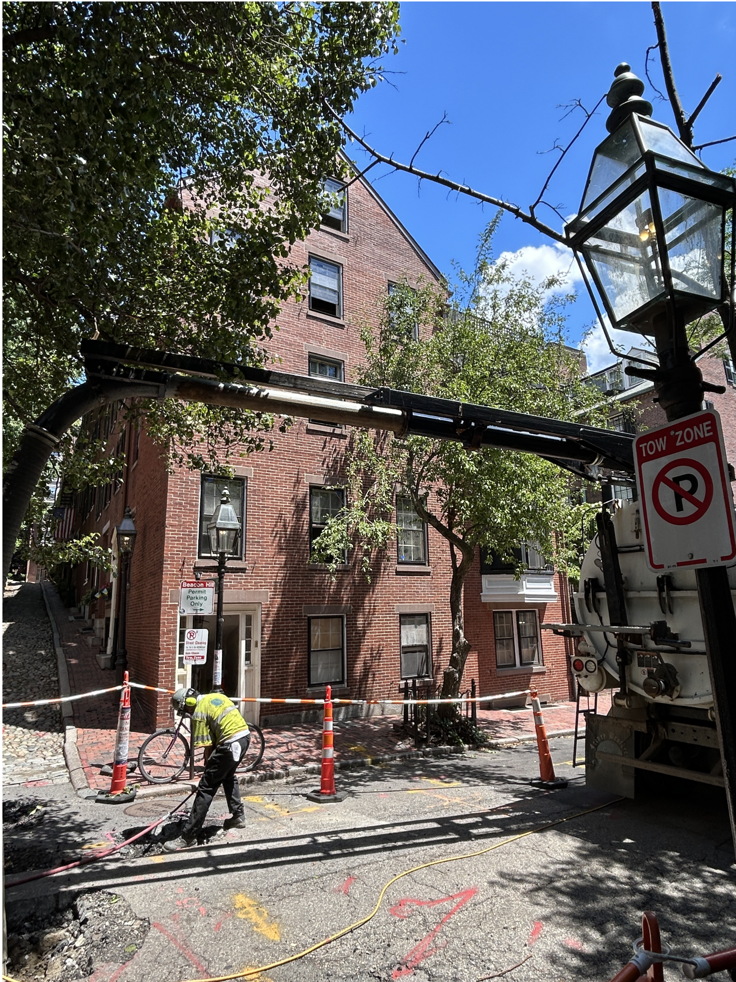
EAST ELEVATION WEST CEDAR STREET JUNE 27, 2024