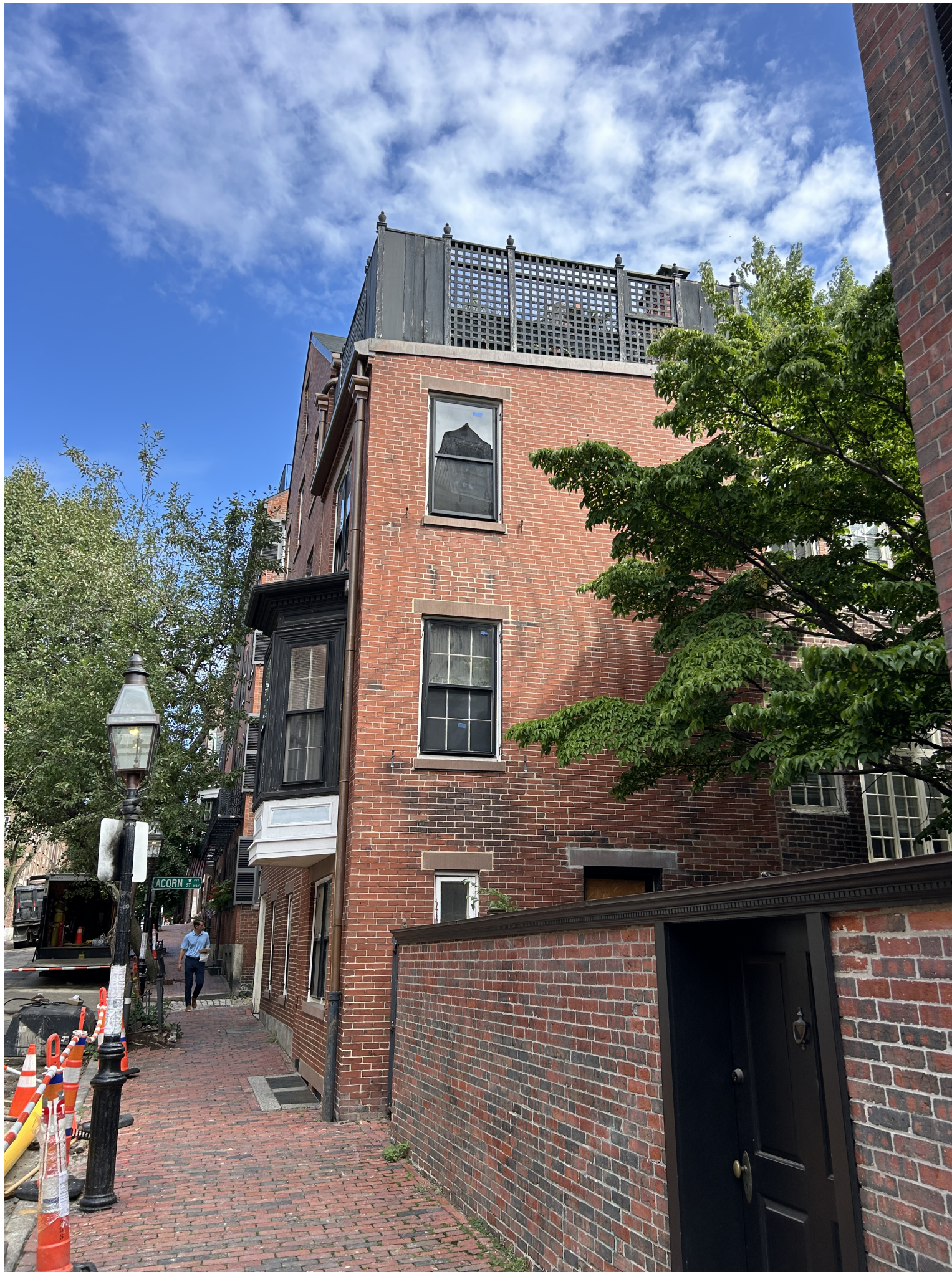
WEST ELEVATION JUNE 27, 2024