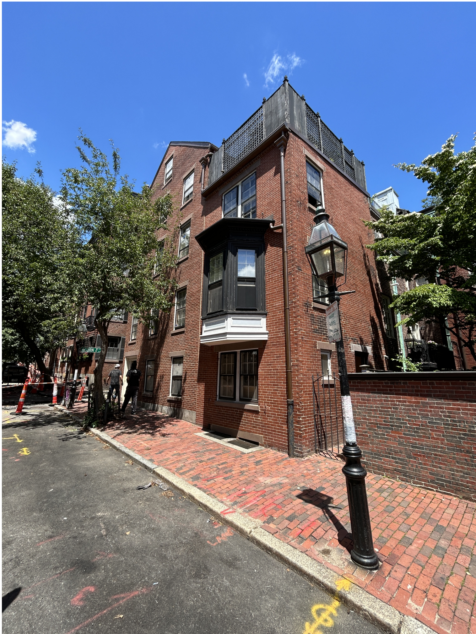
SOUTH AND WEST ELEVATIONS WEST CEDAR STREET JUNE 27, 2024