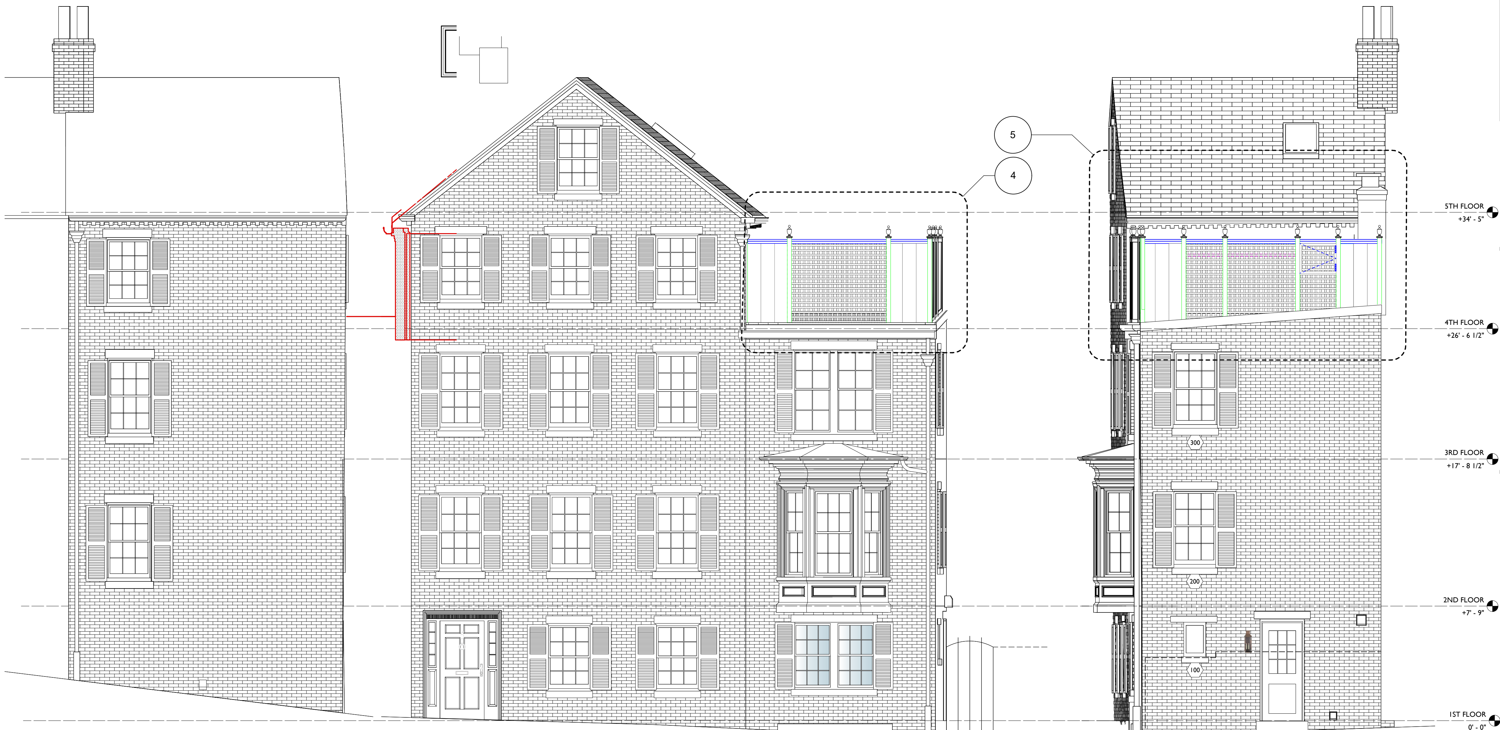
1 NORTH ELEVATION Scale: 1/4" = 1'-0"