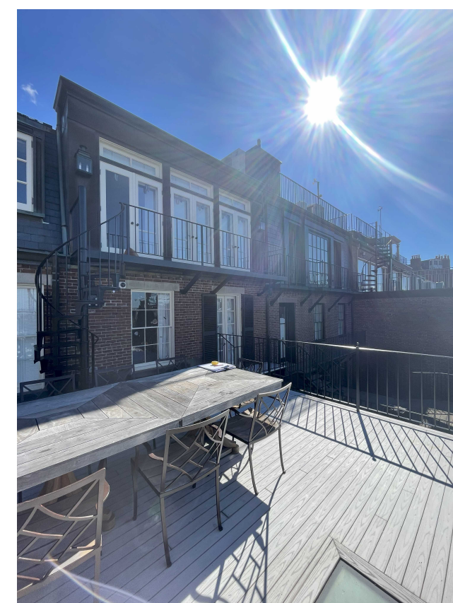
5 EXISTING REAR DORMER Scale: Actual Size