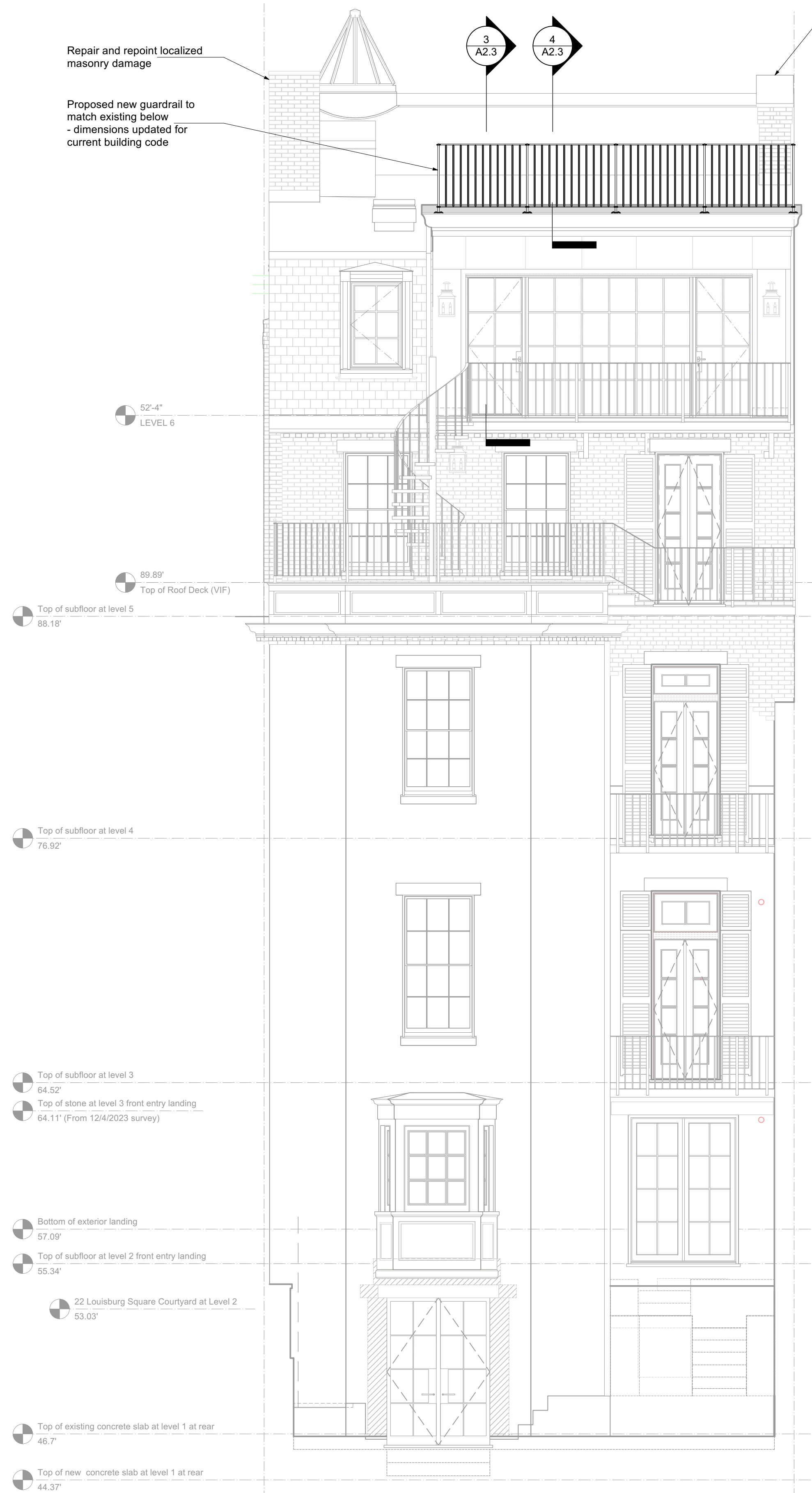
2 PROPOSED REAR ELEVATION Scale: 1/4" = 1'-0"