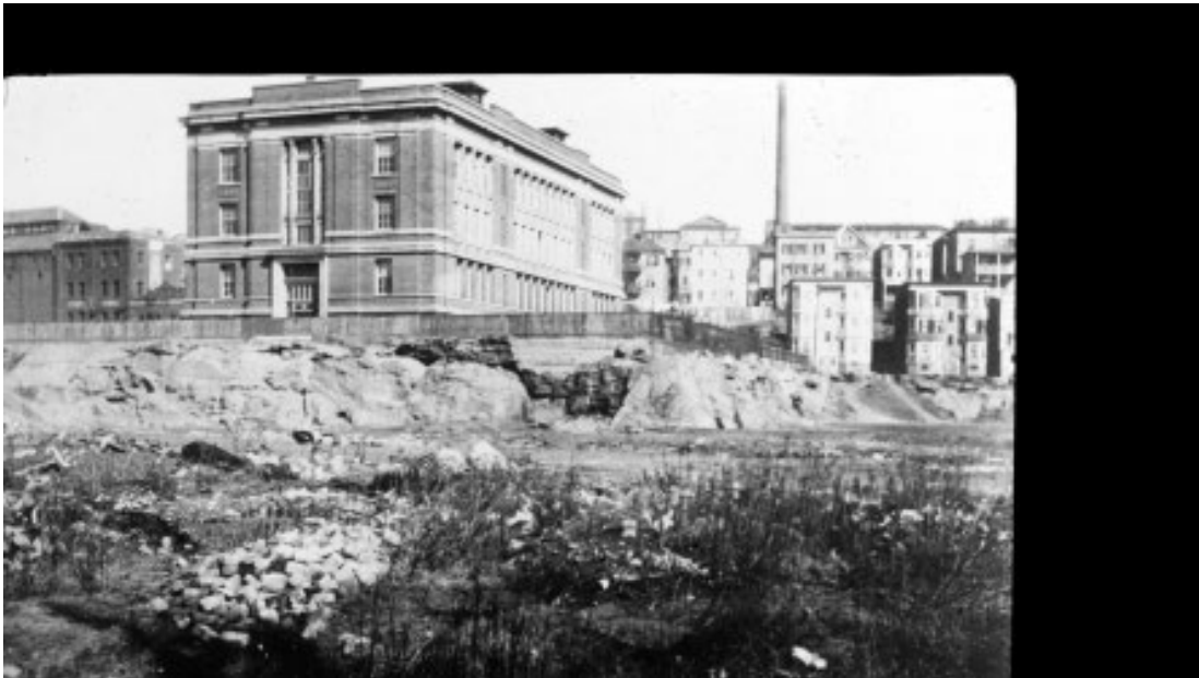
Historic photograph of Jefferson Playground