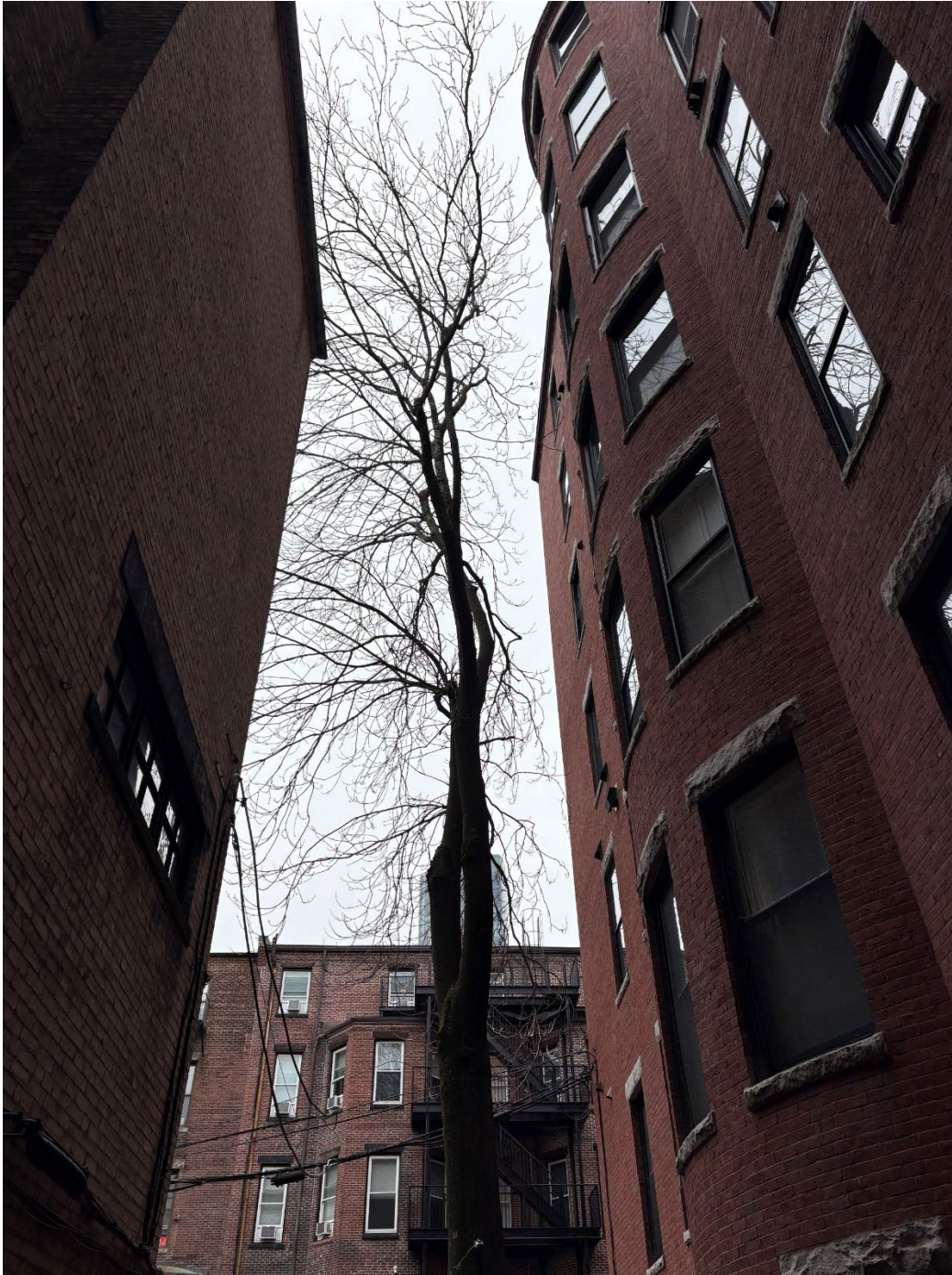
Figure 3. History of “lions tail” pruning to achieve clearance objectives

THE F.A. BARTLETT TREE EXPERT COMPANY SCIENTIFIC TREE CARE SINCE 1907