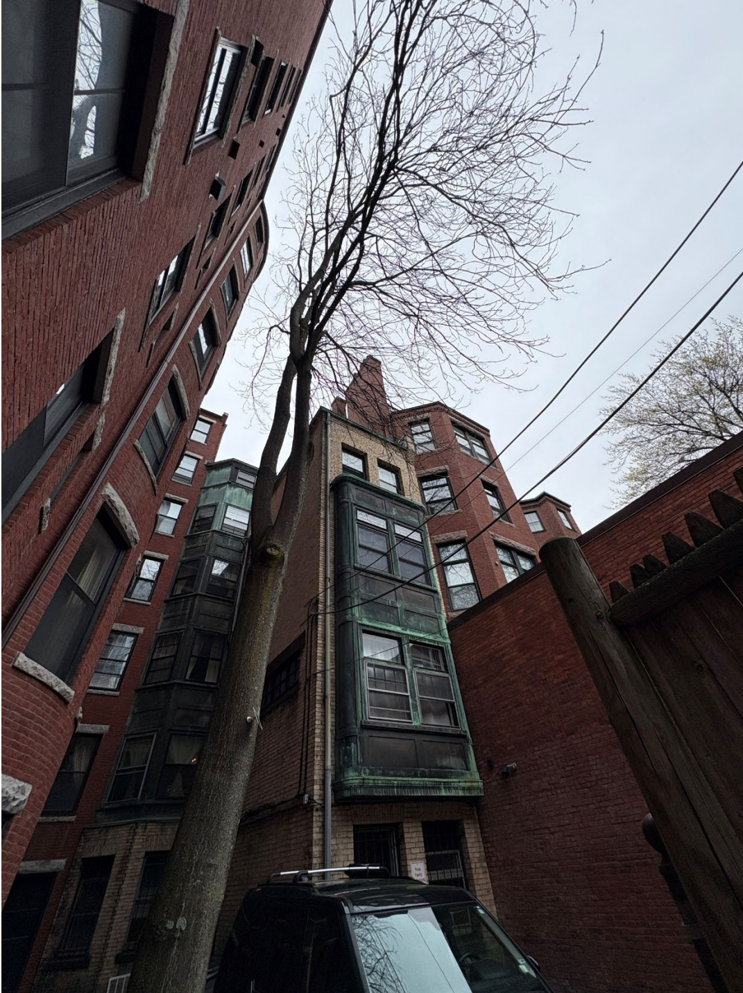
Figure 1. Subject tree: 23" DBH Ailanthus altissima (Tree of Heaven)

THE F.A. BARTLETT TREE EXPERT COMPANY SCIENTIFIC TREE CARE SINCE 1907