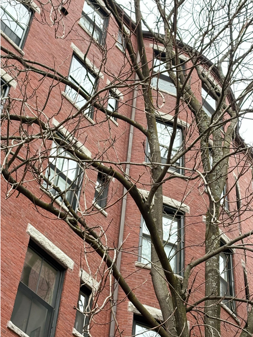
Figure 2. Normal bud swell on exterior branches

THE F.A. BARTLETT TREE EXPERT COMPANY SCIENTIFIC TREE CARE SINCE 1907