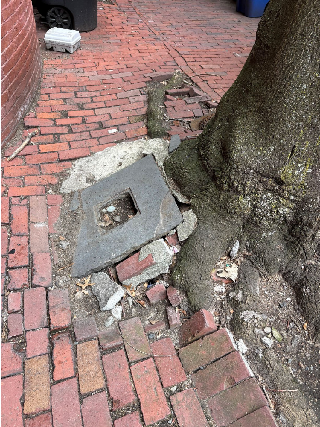
Figure 4. Conflicts with brick pavers and rodent burrows under the root flare

THE F.A. BARTLETT TREE EXPERT COMPANY SCIENTIFIC TREE CARE SINCE 1907